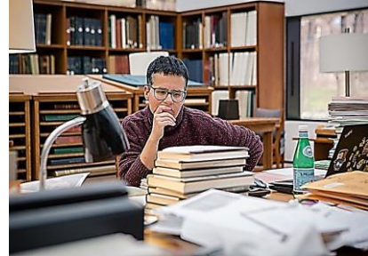
Page 223: Maktabat Muhammad al-Mansur, ZMT 01367 031