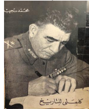
1975 Cover of Najib's Memoirs