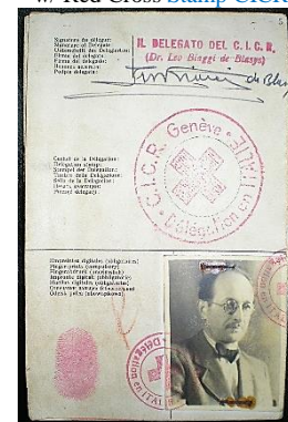
Adolf Eichmann’s Passport w/ Red Cross Stamp CICR