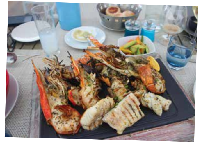
with its creole culture and access to seafood, the food in Mauritius is fresh and unforgettable, such as this seafood platter at Beach Rouge at LUX* Belle Mare Resort.