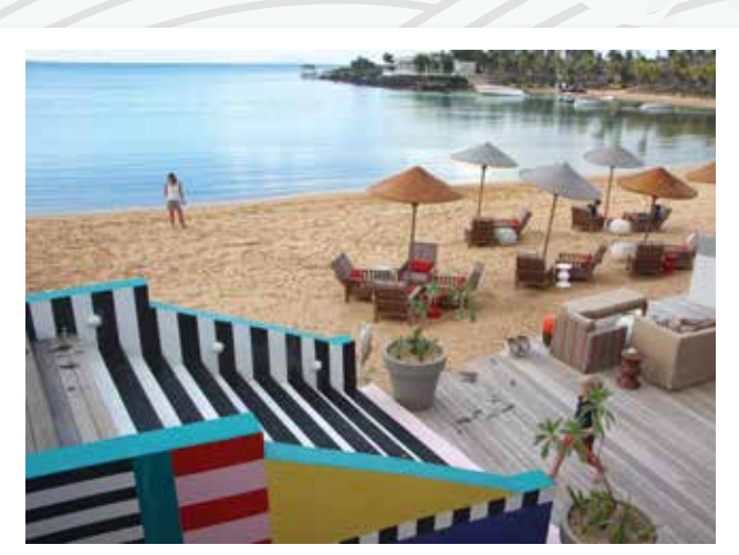
Colourful murals by French-born artist Camille Walala at LUX* Grand Gaube Resort are inspired by the vivid shades of local homes, and street art in the capital Port Louis.