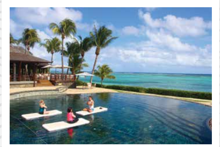
Stretch tired mountain-climbing or bike-riding muscles with a floating yoga session at LUX* Le Morne Resort. It's really quite something, overlooking the Indian ocean.