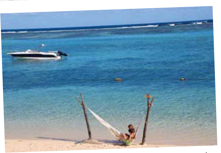
when you've exhausted yourself after hiking to the summit of the 556 metres-above-sea-level Le Morne mountain, there's plenty of quiet locations on LUX* Le Morne Resort to swing.