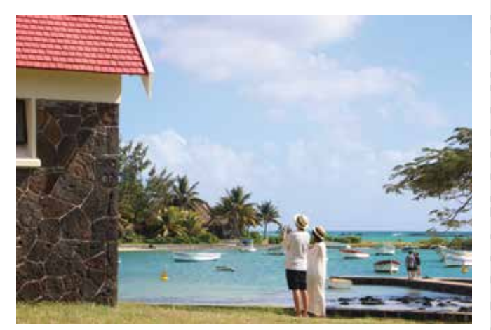
One of the most famous churches on the ísland, the Catholic Notre Dame Auxiliatrice Chapel in the small village of Cap Malheureux, is popular for its vibrant red roof.