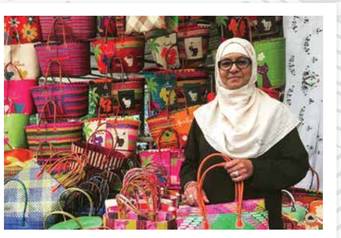
At Flaq market on Sundays, watch as Maurítíans buy and sell their wares and produce. Lose yourself in the heady aromas of colourful spices, and sip on coconut water.

The East African island of Mauritius is a melting pot of creole culture, along with postcard-worthy beaches as discovered when staying with three properties in the LUX* Collective portfolio. Words and photography by Katrina Holden