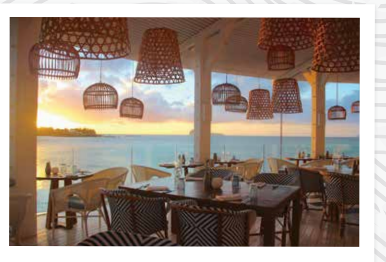
This Turkish restaurant sits on its own mini peninsula at LUX* Grand Gaube Resort, serving cuisine prepared by Turkish chefs. The wine list includes five Turkish wines.