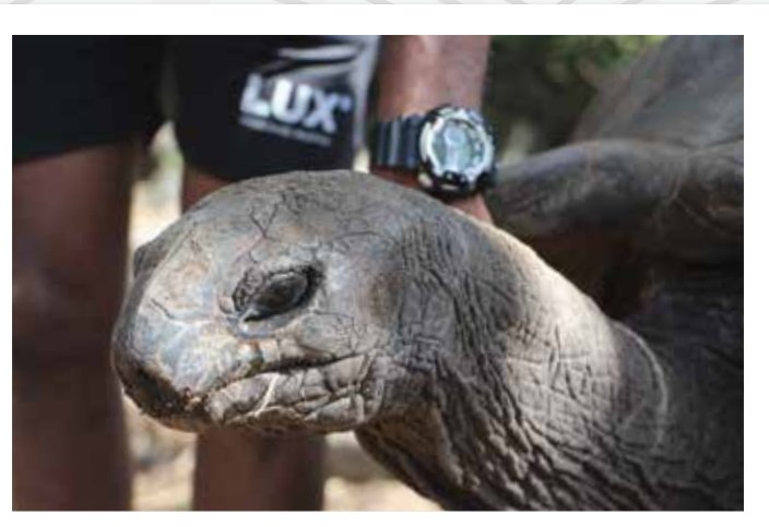
Take a cycling tour into the local village of Melville with LUX* wellness staff to meet this special tortoise, more than 100 years old. This old gent loved being patted under the chin!