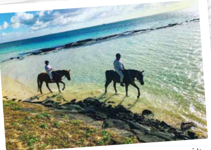
At LUX* Belle Mare Resort, take a guided, gentle horse ride along the water's edge - the island's widest stretch of beach before stopping for breakfast at your private beach table.