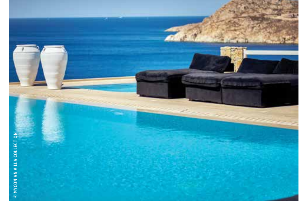
ABOVE: Black velvet daybeds by the infinity pool at Myconian Villa Collection.