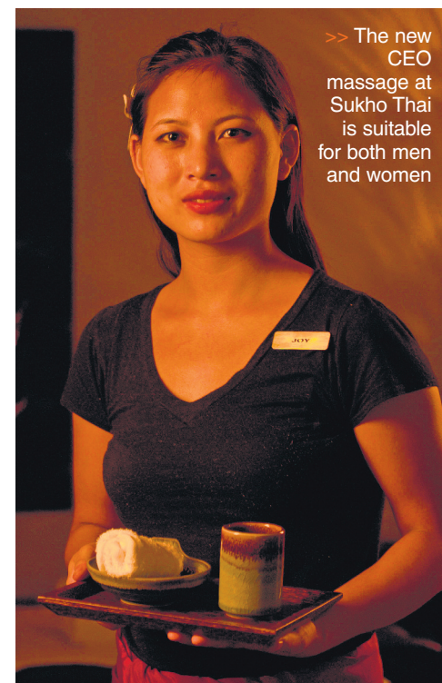
>> The new CEO massage at Sukho Thai is suitable for both men and women

On the whole, the CEO massage is one of the best treatments I have experienced. It costs