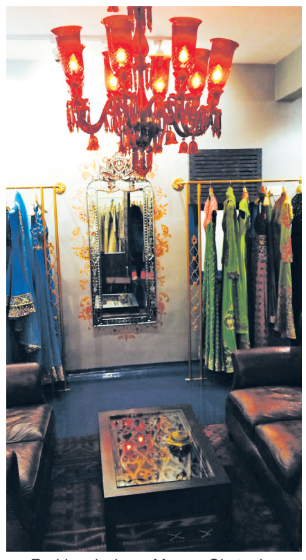
>>> Fashion designer Mayyur Girotra has opened a new store. Read on to find out if it is worth a visit

The bridal and ethnic wear is available in the usual shades of blue, yellow, red, green and black. Their black anarkalis stood out – not because they were better than the rest, but because the black cloth highlighted the