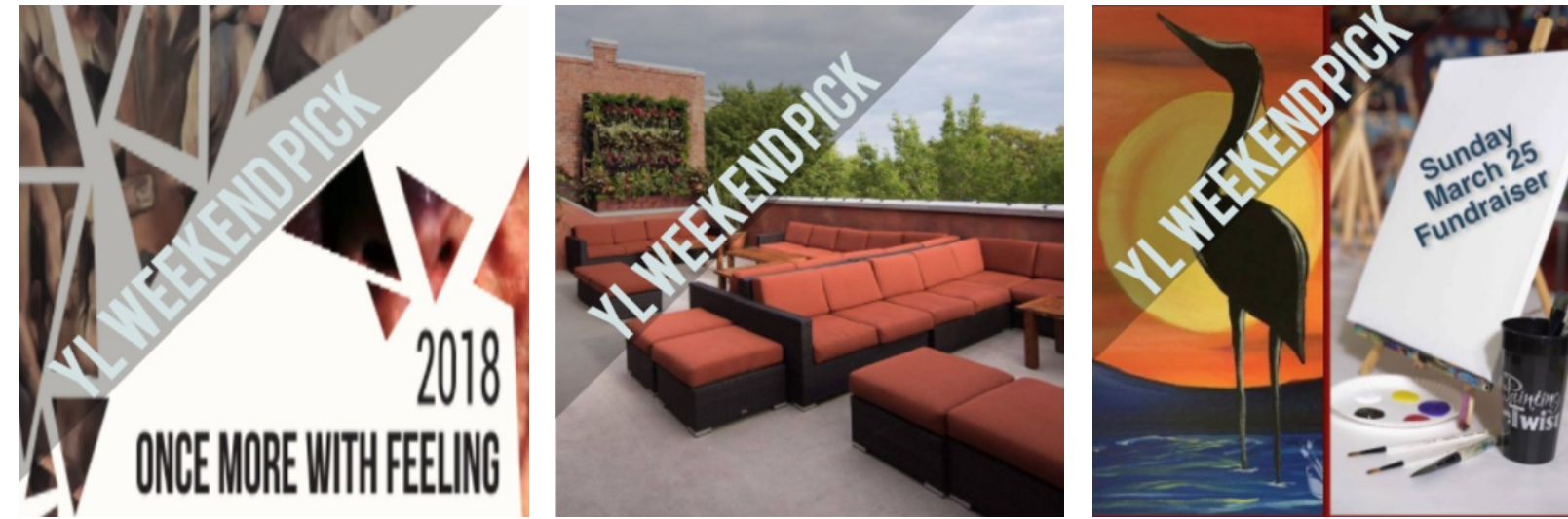
Once More With Feeling Rooftop Pilates & Smoothies Painting with a Purpose