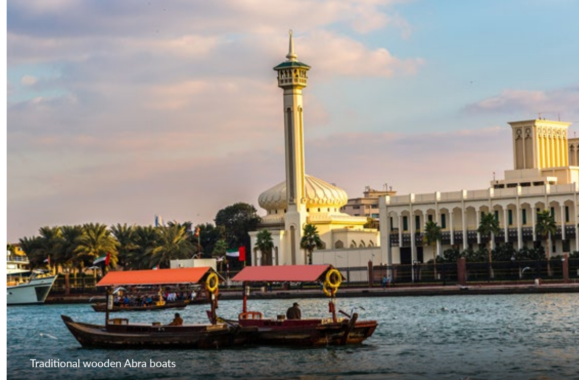
Traditional wooden Abra boats

ARTE market also runs a monthly makers' market in Dubai, showcasing a range of quality handmade goods that can't be found elsewhere.