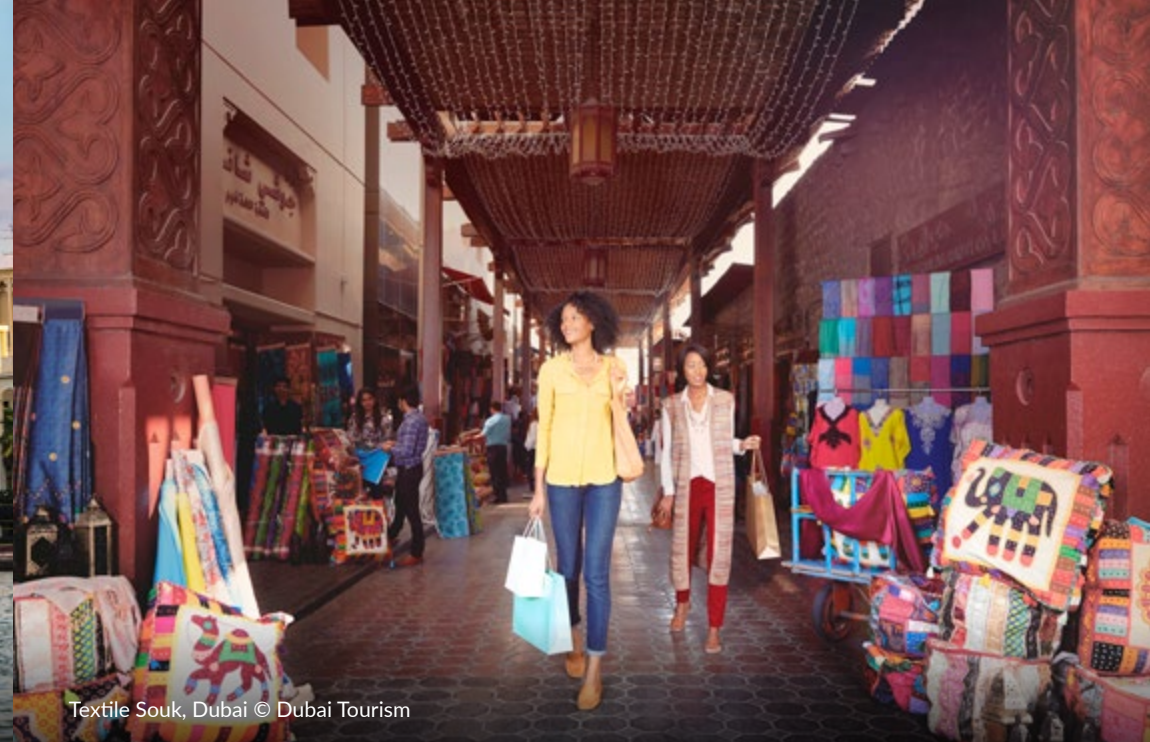
Textile Souk, Dubai