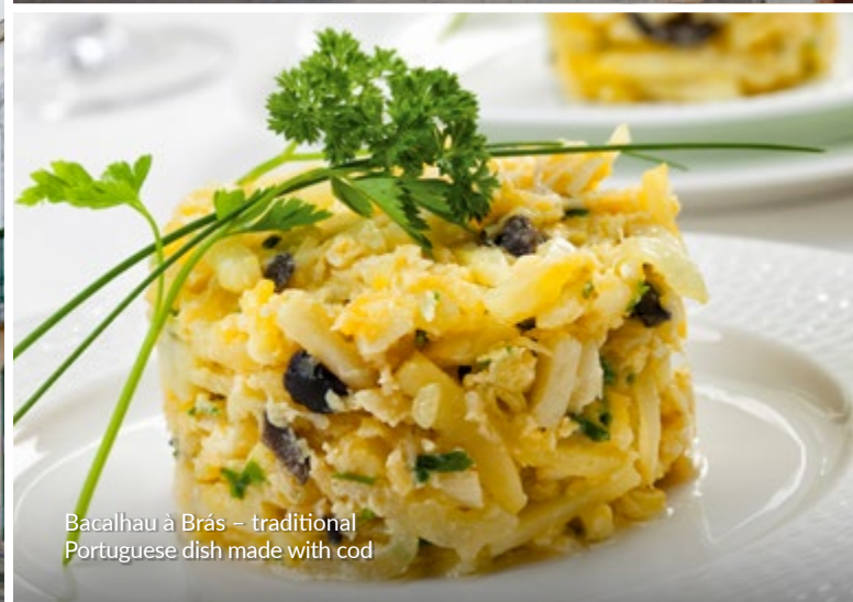
Bacalhau à Brás – traditional Portuguese dish made with cod