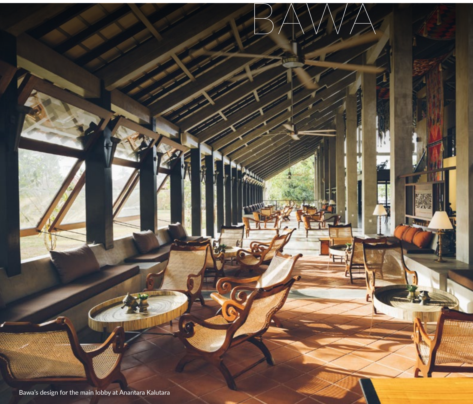
Bawa's design for the main lobby at Anantara Kalutara