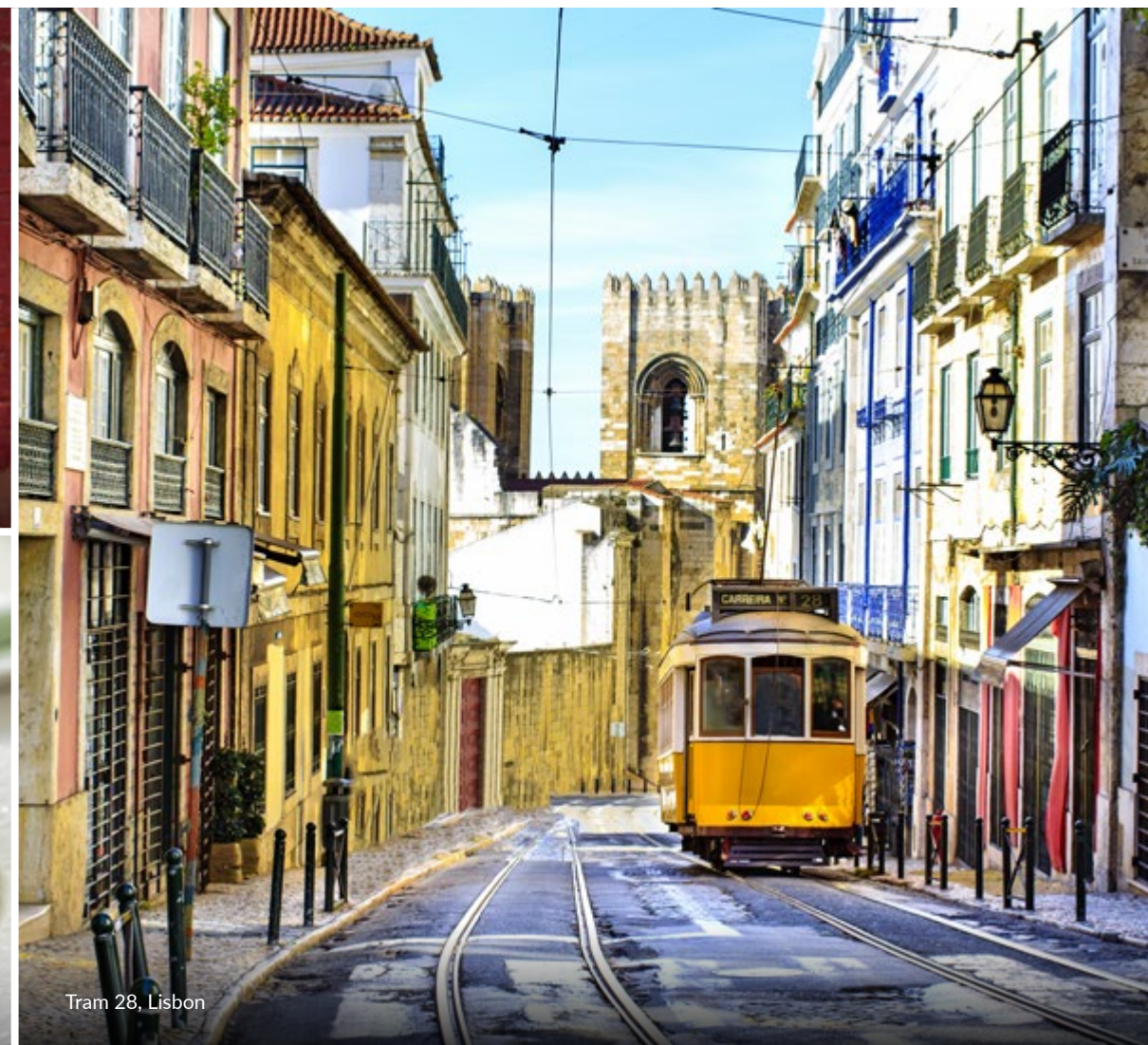
Tram 28, Lisbon

Portugal is having a moment now that no one expected. Just seven years ago, the coastal country was on the cusp of a debilitating debt crisis – local businesses shuttered, young professionals fled. But a determined economic turnaround later, Portuguese shores are once again riding a wave of resurgence, from the capital Lisbon to the southernmost banks of the Algarve. Cultural venues, restaurants and attractions are opening by the boatload, making Portugal arguably the most exciting destination in Europe right now.