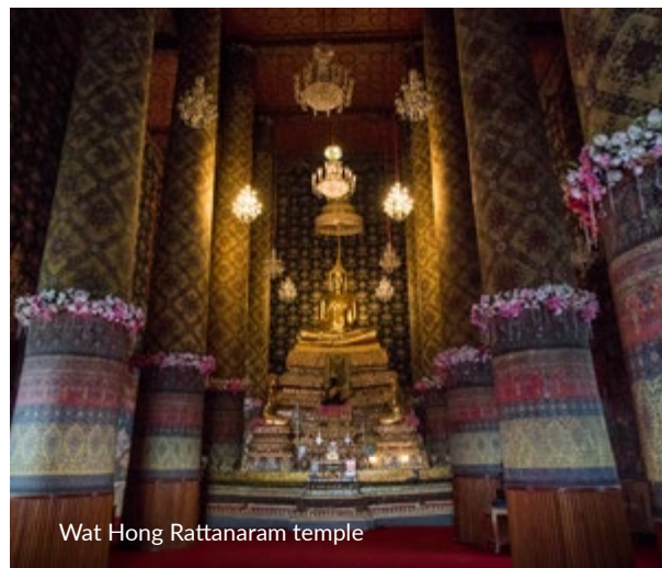
Wat Hong Rattanam temple

Taking a trip along these waterways reveals a network which has been vital to Bangkok's transportation and prosperity for centuries. Nowadays, the banks are bursting with classical wooden houses, farms and businesses. Discover where the locals buy their seafood, visit a riverside supermarket, or have a ready-made meal come to you as a boat cooking skewers on-board floats by.