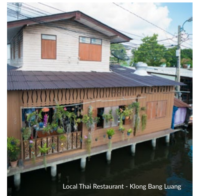
Local Thai Restaurant - Klong Bang Luang

VISIT ANANTARA.COM AND AVANIHOTELS.COM TO RESERVE YOUR RIVERSIDE ESCAPE.