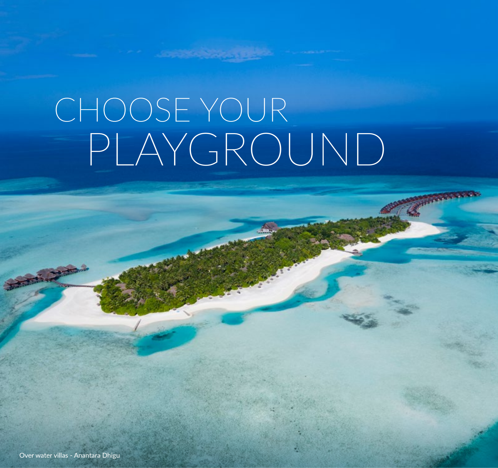
Over water villas - Anantara Dhigu