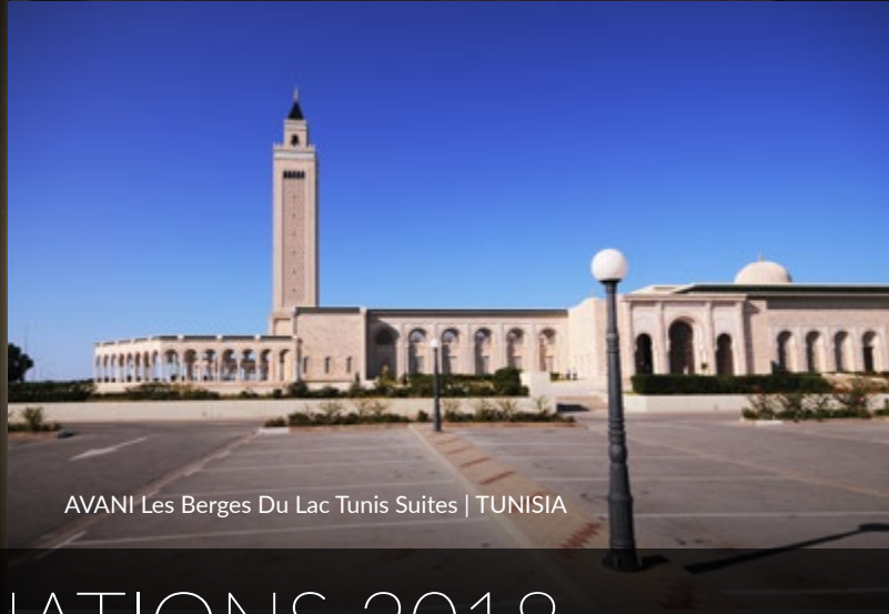
AVANI Les Berges Du Lac Tunis Suites | TUNISIA