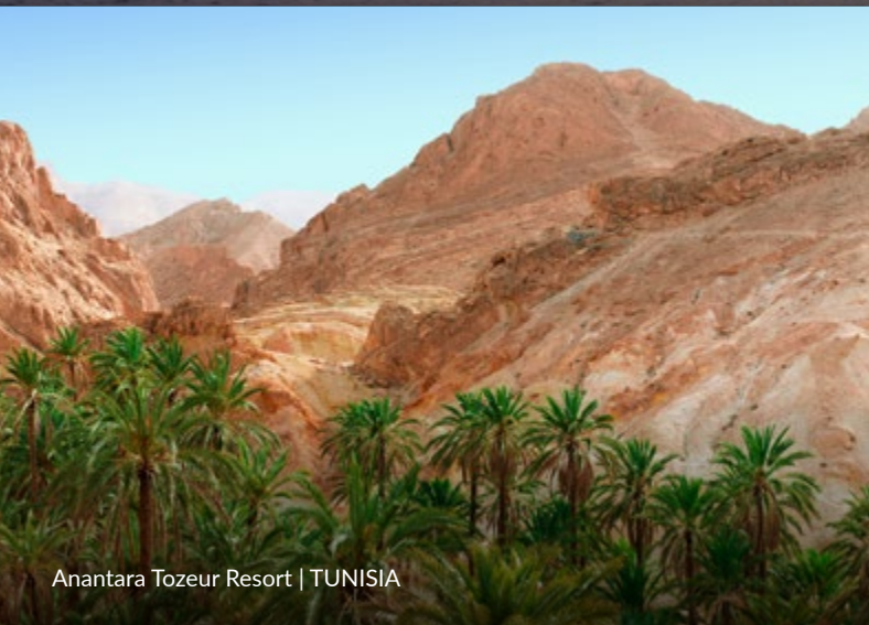
Anantara Tozeur Resort | TUNISIA