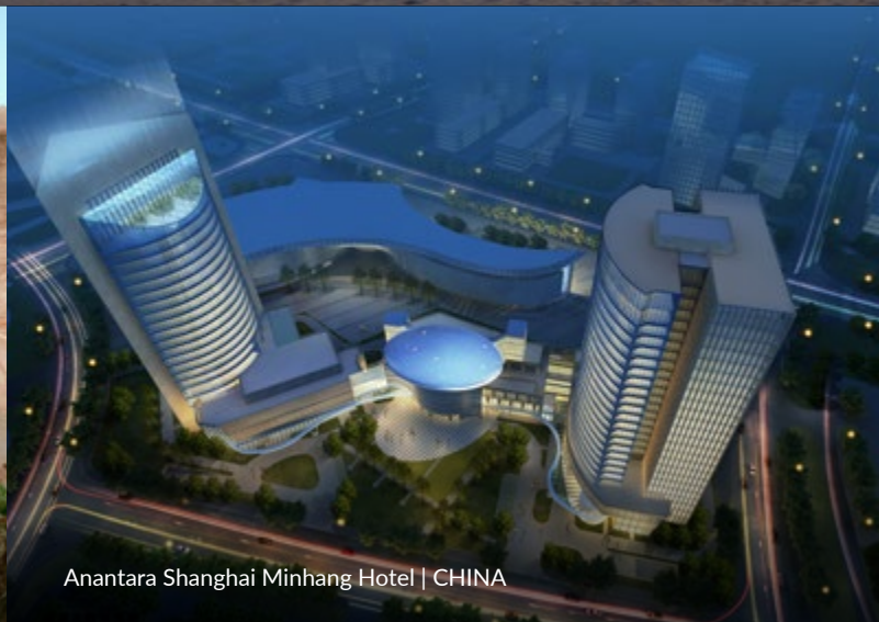
Anantara Shanghai Minhang Hotel | CHINA