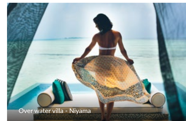
Over water villa - Niyama

While Indian Ocean beauty and luxury beyond compare are a given in the Maldives, hoteliers who live and breathe the island life will tell you that each paradise is unique. From the size, shape, flora and fauna of the island to the surrounding lagoon and surf – each island has its own soul. The personality of the General Manager trickles down to the staff. Breathtaking moments range from movies under the stars to dining on deserted sandbanks, and are interspersed with quiet touches like curated soundtracks in-room and a popcorn machine.