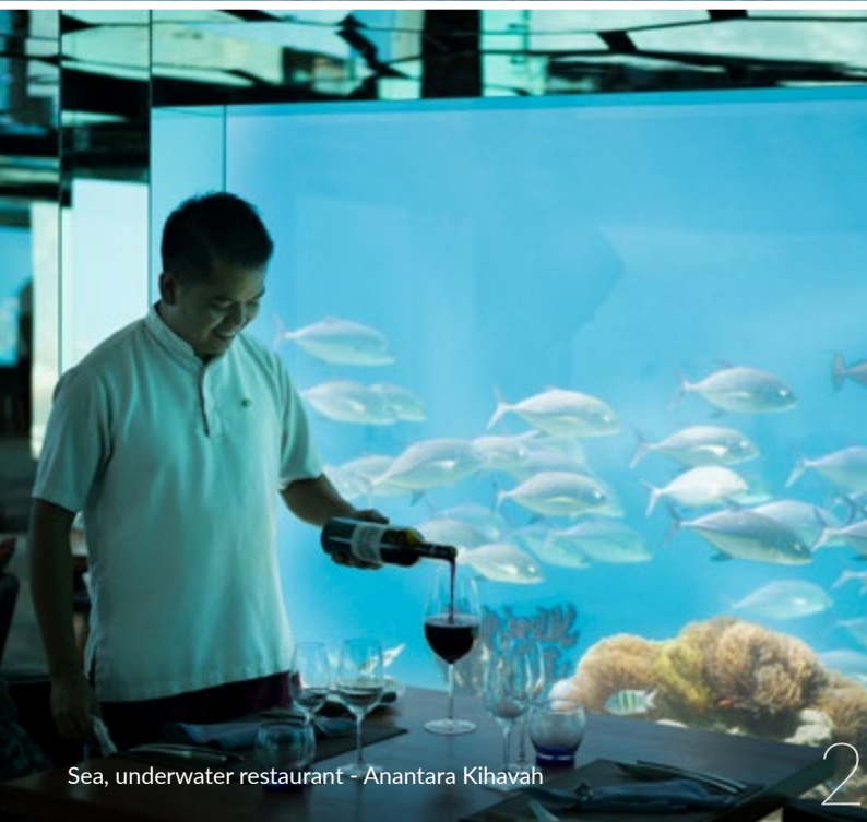
Sea, underwater restaurant - Anantara Kihavah