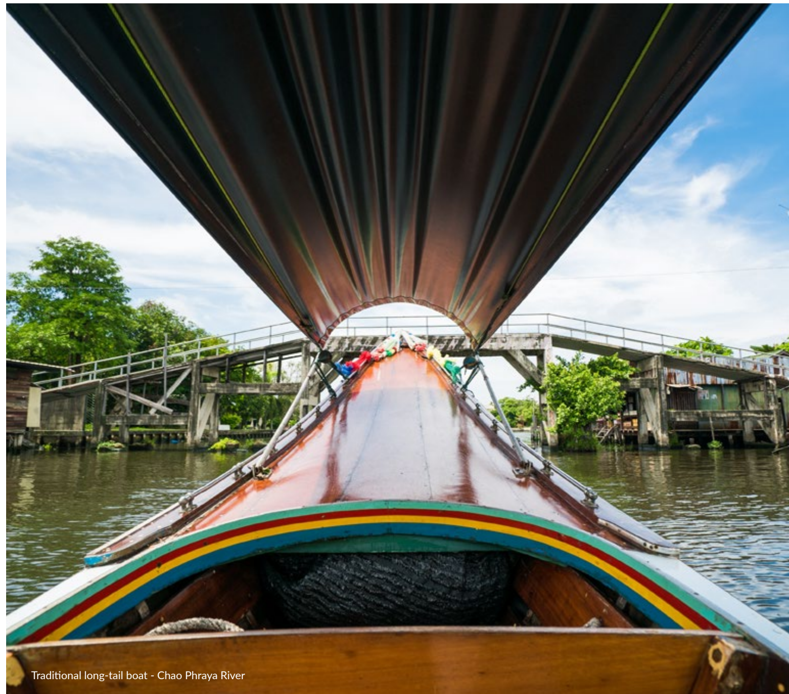
Traditional long-tail boat - Chao Phraya River

Back aboard the long-tail, as you pass by homes with friendly Thai people smiling and waving, it's hard to imagine this is the same world as the busy streets and overflowing sidewalks. The peace and tranquillity of the klongs transport you to a part of Bangkok still rarely seen by many visitors and remains as a time capsule of how the city once was.