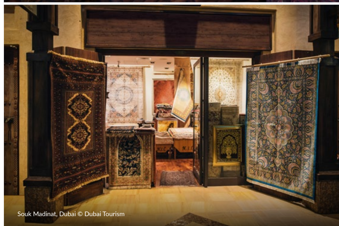
Souk Madinat, Dubai

VISIT ANANTARA.COM OR AVANIHOTELS.COM TO BOOK THE PERFECT ROOM, SUITE OR VILLA FOR A UAE SHOPPING HOLIDAY.