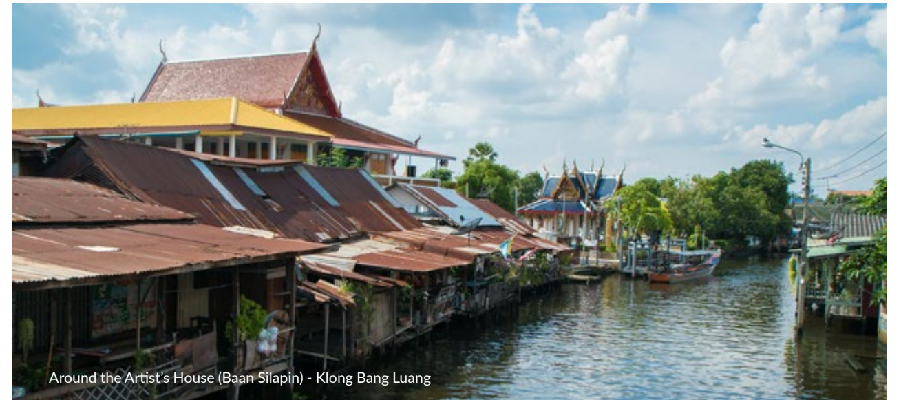
Around the Artist's House (Baan Silapin) - Klong Bang Luang

rice makes the perfect traditional dessert, or try a unique Thai iced tea or coffee. Afterwards, wander through the Artist's House, home to a variety of local drawings, paintings, prints and carvings. Enjoy a Thai puppet dance show, and watch stories of the country's ancient stories come to life in a lively and colourful performance.