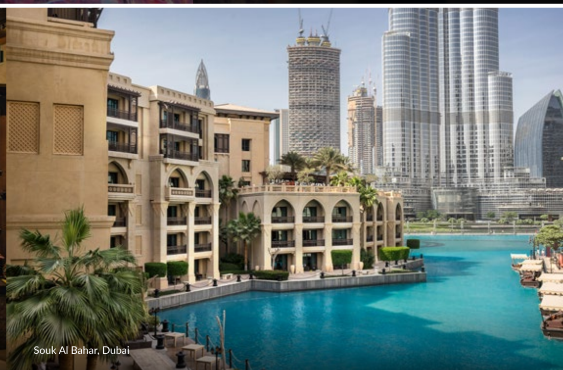
Souk Al Bahar, Dubai