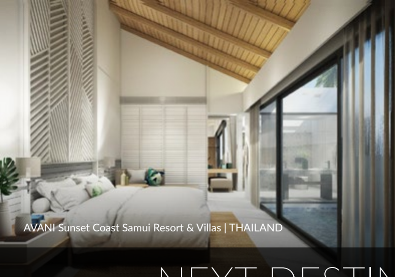
AVANI Sunset Coast Samui Resort & Villas | THAILAND