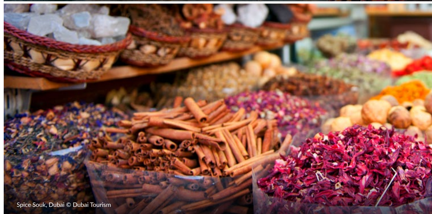
Spice Souk, Dubai

EASTERN MANGROVES HOTEL & SPA BY ANANTARA OFFERS AN OPULENT CITY RETREAT IN ABU DHABI, LOCATED BY A PROTECTED MANGROVE FOREST. IN DUBAI, GUESTS CAN CHOOSE TO STAY AT ANANTARA THE PALM DUBAI RESORT FOR ASIAN-INSPIRED LUXURY ON THE ICONIC PALM JUMEIRAH OR BE IMMERSSED IN CITY CHARMS AT AVANI DEIRA DUBAI HOTEL, WITH CONVENIENT ACCESS TO ALL THE MAIN ATTRACTIONS.