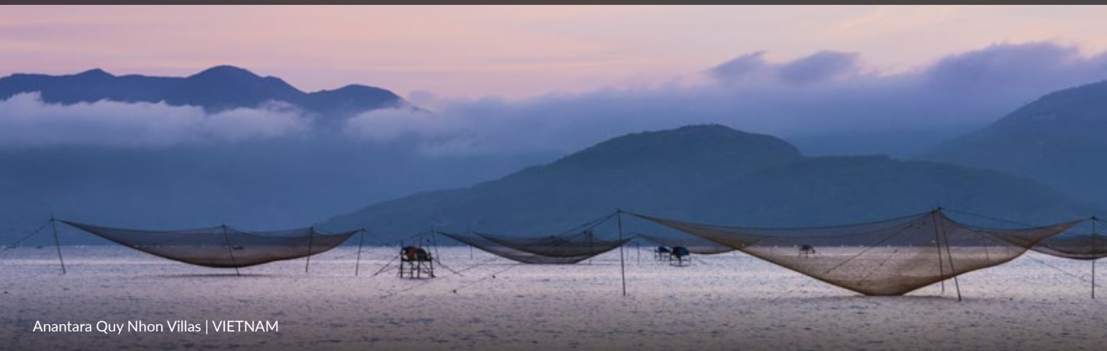
Anantara Quy Nhon Villas | VIETNAM