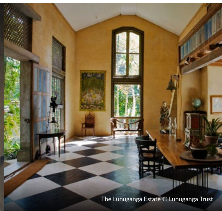
The Lunuganga Estate