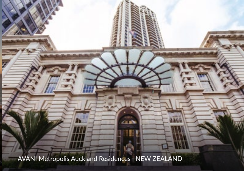
AVANI Metropolis Auckland Residences | NEW ZEALAND