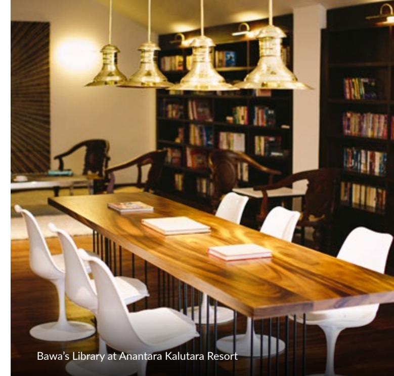
Bawa's Library at Anantara Kalutara Resort

From modest townhouse to corporate office to sprawling oceanfront university, the prolific architecture of Geoffrey Bawa pervades the Sri Lankan landscape, and his works have come to define the Tropical Modern movement. Always in response to and in harmony with the surrounding environment, Bawa's love affair with architecture began with the purchase of Lunuganga Estate in 1948 near Bentota.