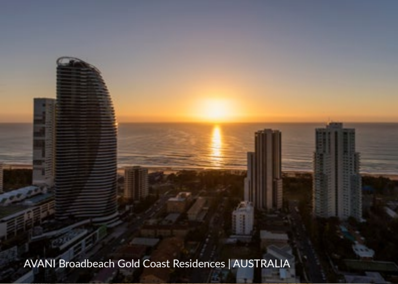
AVANI Broadbeach Gold Coast Residences | AUSTRALIA