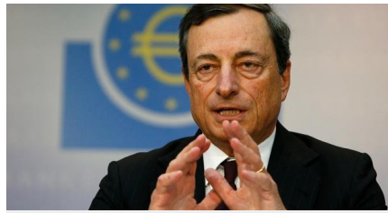
Mario Draghi

Home » Finance » Economy » Mario Draghi: Europe will drift into "uncharted waters"