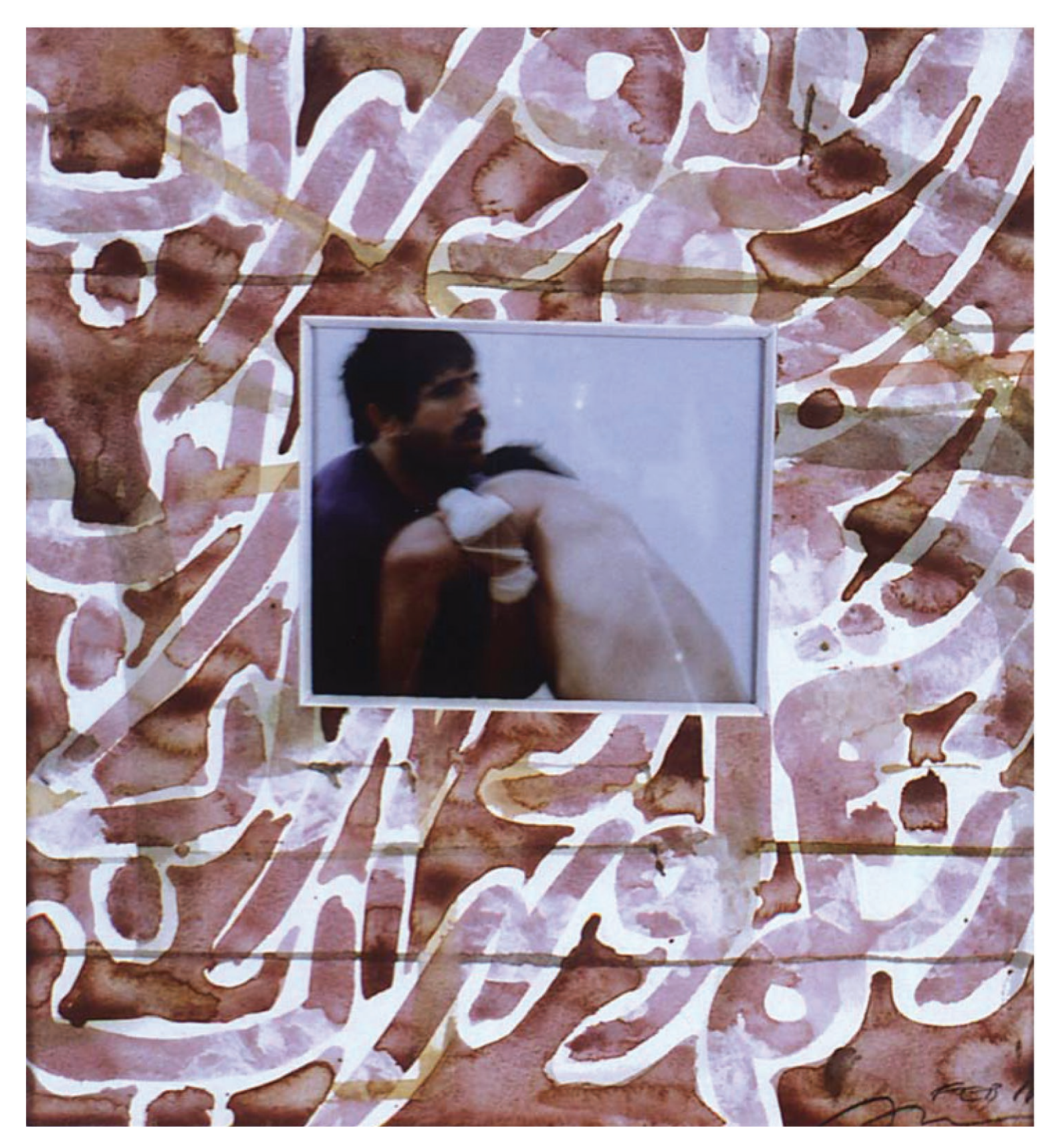
Fereydoun Ave. Untitled (Rostam & Sohrab +Script Series). 2000. Watercolours, photography on paper. 53 x 42 cm