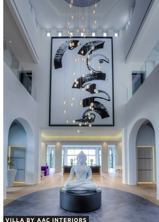
VILLA BY AAC INTERIORS