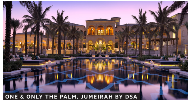
ONE & ONLY THE PALM, JUMEIRAH BY DSA