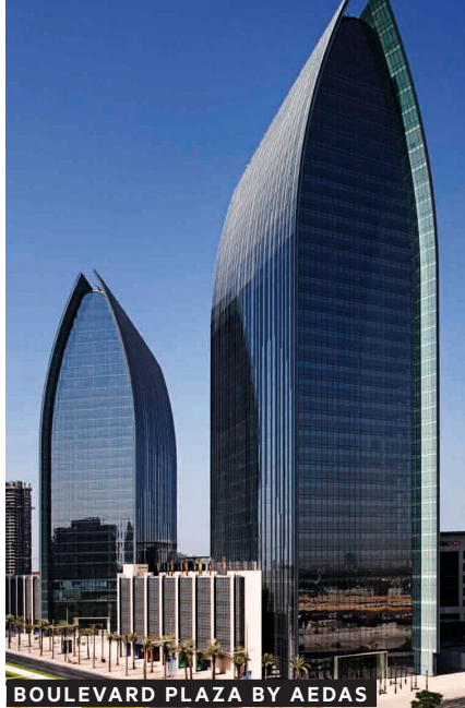
BOULEVARD PLAZA BY AEDAS