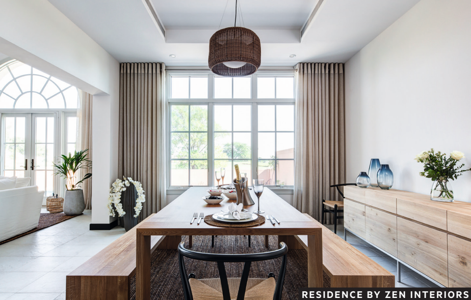
RESIDENCE BY ZEN INTERIORS