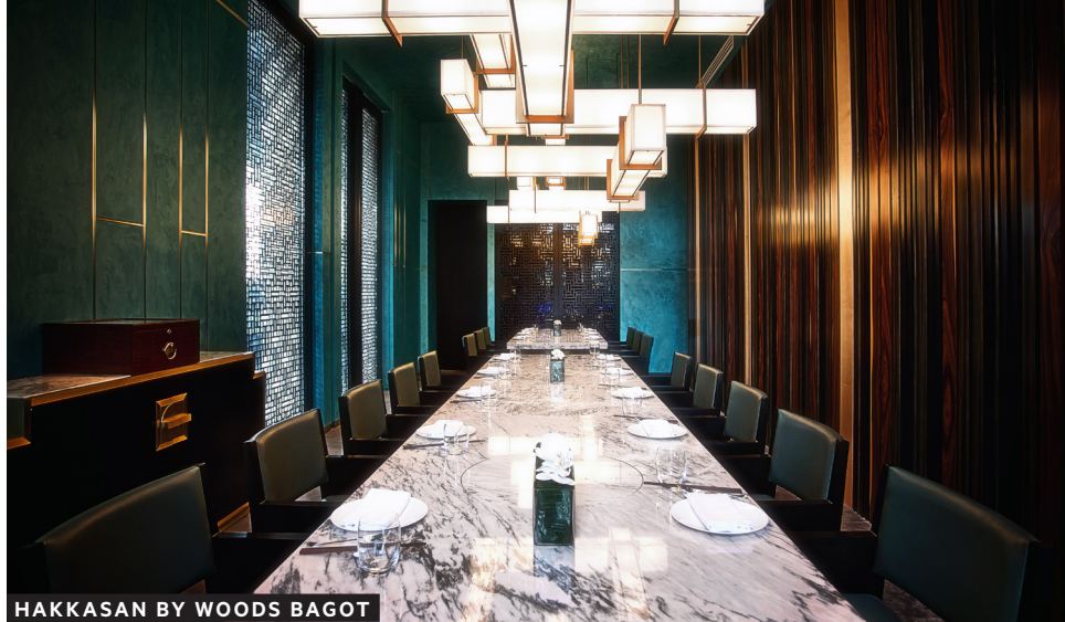
HAKKASAN BY WOODS BAGOT