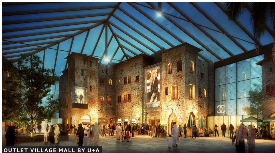
OUTLET VILLAGE MALL BY U+A

government assignments in the UAE. His VIP clientele regard him as a trusted partner, which is why they return. With an understanding for the region's inclination towards chic opulence, and the importance of an environment in the overall success of an organisation's culture and bottom line, Kart Design is dedicated to creating a lasting impact within spaces. KEY PROJECTS: The Executive Office, the Prime Minister's Office, both in Emirates Towers, and the Ministry of Cabinet affairs. Dubai; kartdesign.net