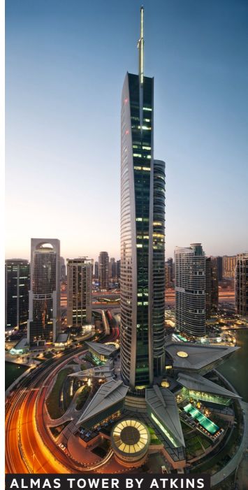
ALMAS TOWER BY ATKINS