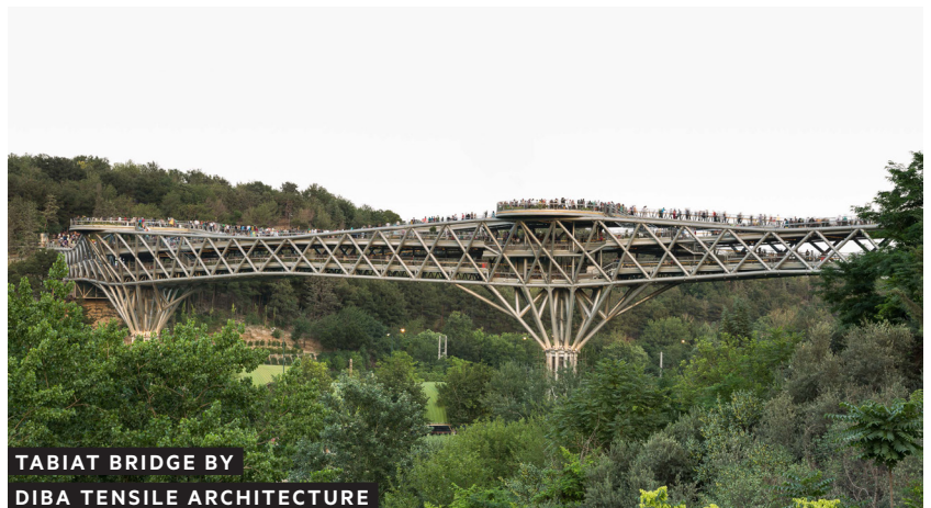
TABIAT BRIDGE BY DIBA TENSILE ARCHITECTURE