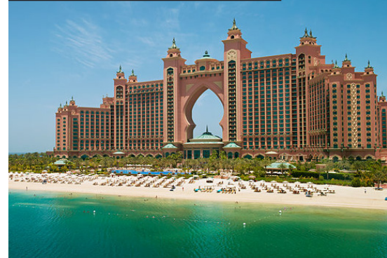
ATLANTIS BY WILSON ASSOCIATES