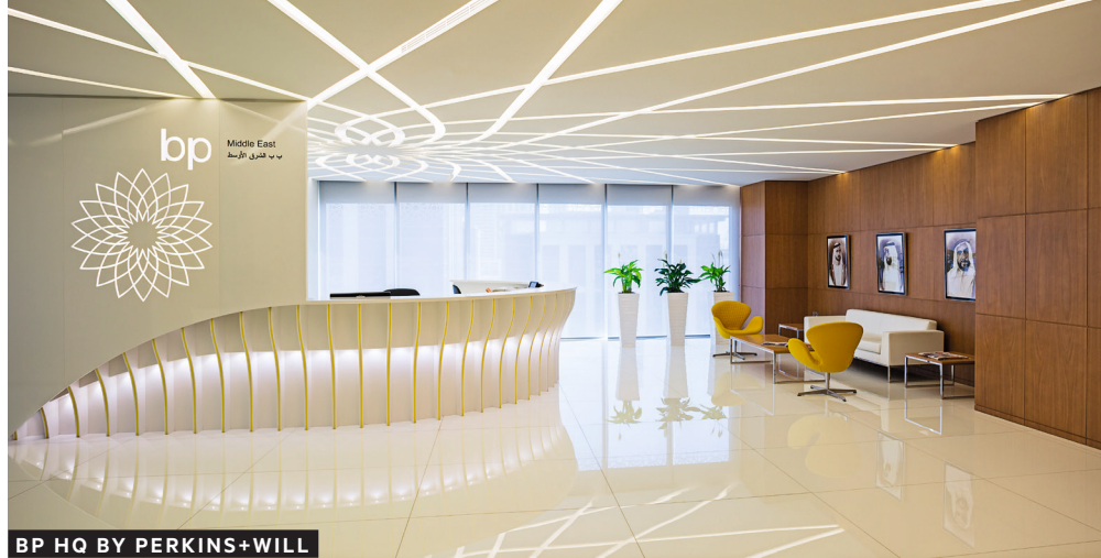
BP HQ BY PERKINS+WILL