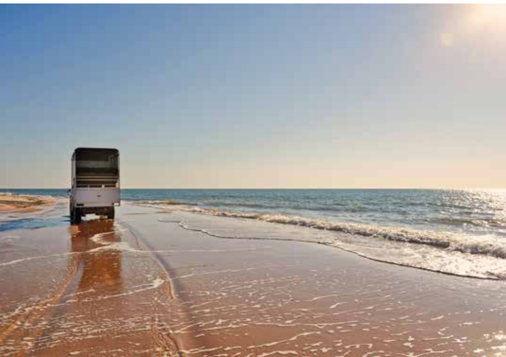
Guests can tour the remote coastline in a four-wheel drive (left); Berkeley River Lodge has a shared deck and pool area, plus 20 eco villas