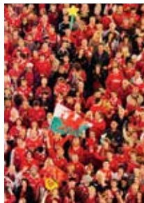
Welsh supporters at the Rugby World Cup in Cardiff

If you go to only one of the Qantas Wallabies' off-season internationals, make it the one with the most passionate fans: Australia versus Wales. Game day in Cardiff is something to behold – a sea of red jerseys flood the city's streets, while a packed Millennium Stadium echoes with more than 70,000 spirited voices. The "Grand Slam" conquest of all four British home nations has been achieved by the Wallabies just once, in 1984 – an indication of the feat's difficulty. After Wales, Australia faces Scotland in Edinburgh, France in Paris, Ireland in Dublin, and England in its grey Twickenham fortress.