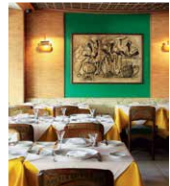
Sample traditional Brazilian dishes at Casa da Feijoada

Eat Brazil is famous for barbecued meats and no trip to Rio is complete without a visit to Porcão (porcao.com.br), a churrascaria with an all-you-can-eat buffet. Also in the Ipanema neighbourhood, try the feijoada – stew of beans, pork and beef – at Casa da Feijoada (cozinhatipica.com.br).