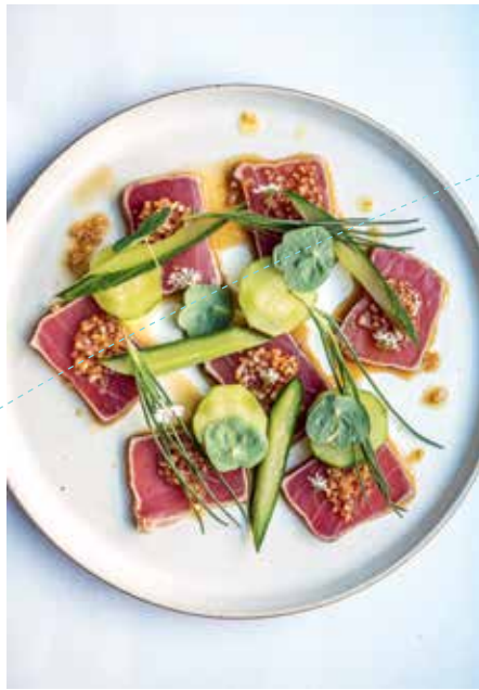
Sexy Fish (far left); the restaurant's yellowfin tuna tataki (left); the peloton rides the Abbeville-to-Le Havre leg of 2015's Tour de France