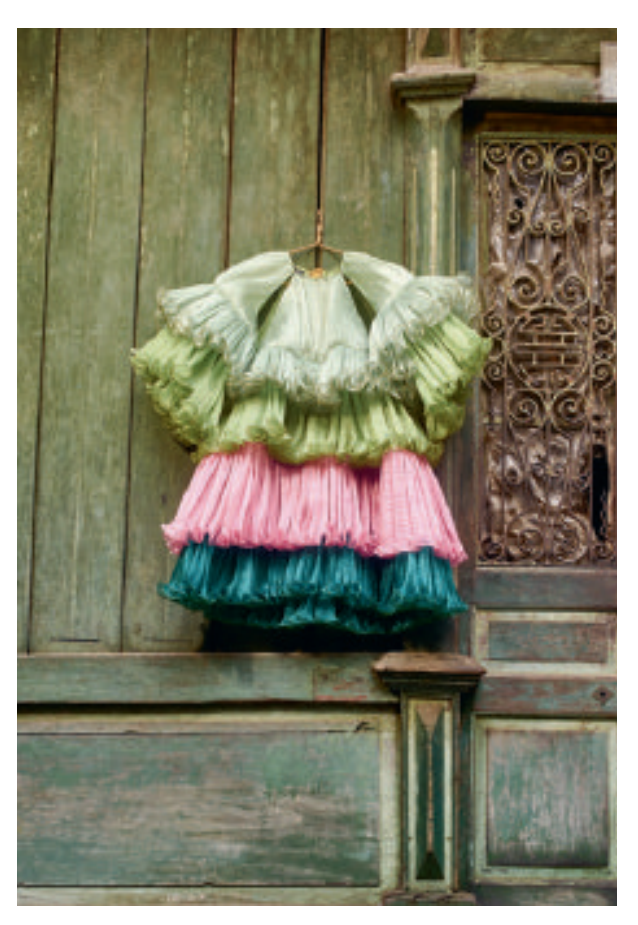
This page, clockwise from top left Dress by Thuy Design House; black lacquer box by Tanmy Design; dress by Thuy Design House; tea box by Hanoia