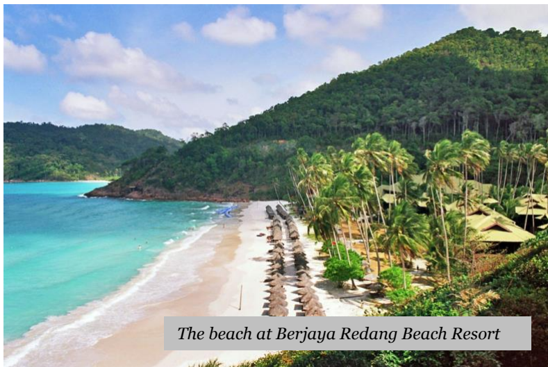
The beach at Berjaya Redang Beach Resort

Set amidst the turquoise blue waters of Teluk Dalam, Berjaya Redang Beach Resort has white sandy beaches which is perfect for lazing around. The resort features 220 tastefully furnished rooms and suites in Malaysian-style chalets. The 130 elegant and luxurious guestrooms and suites on the hillside are the Redang Hill View and Redang Sea View categories. Berjaya Redang Beach Resort offers both local and international cuisines, a wide variety of recreational activities, spa, as well as conference and banquet facilities.