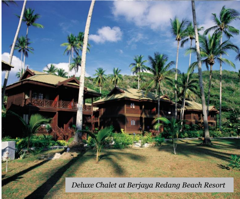
Deluxe Chalet at Berjaya Redang Beach Resort

Being a famous holiday destination, many resorts and hotels are available in Redang, catering to different needs and budgets. For sheer luxury and first-class diving services, or simply to indulge in a romantic getaway, visitors can opt for the reputable Berjaya Redang Beach Resort or the Berjaya Redang Spa Resort.