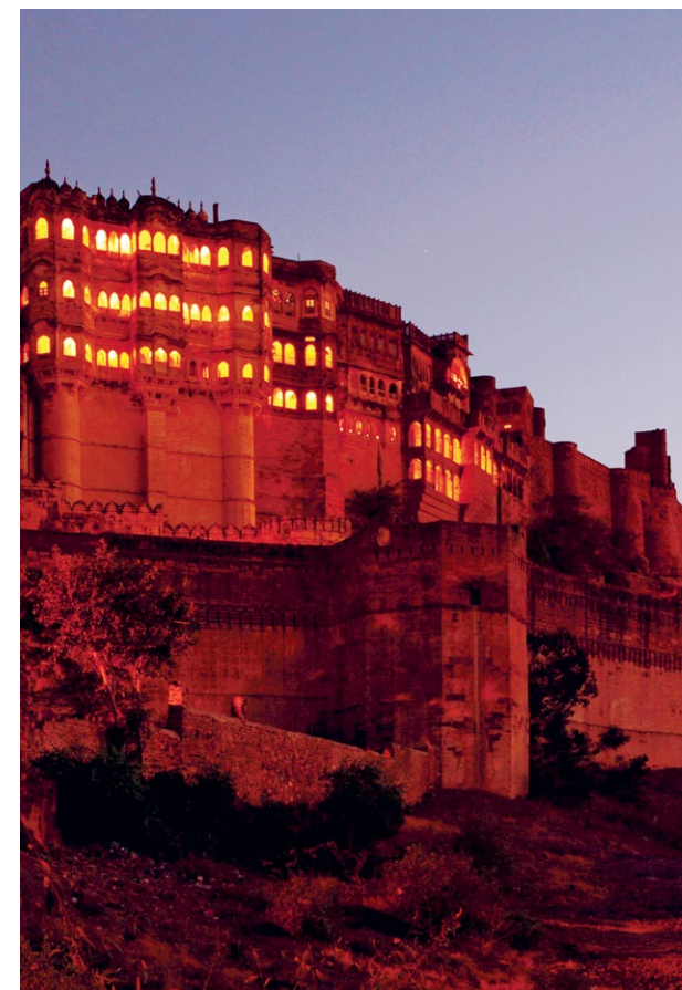
Mehrangarh Fort, winner of a UNESCO award for conservation

the property stands proudly above the city on Chittar Hill; its sprawling 11ha grounds house a family museum, as well as the lavish 70-room hotel, and a breathtaking subterranean zodiac swimming pool.