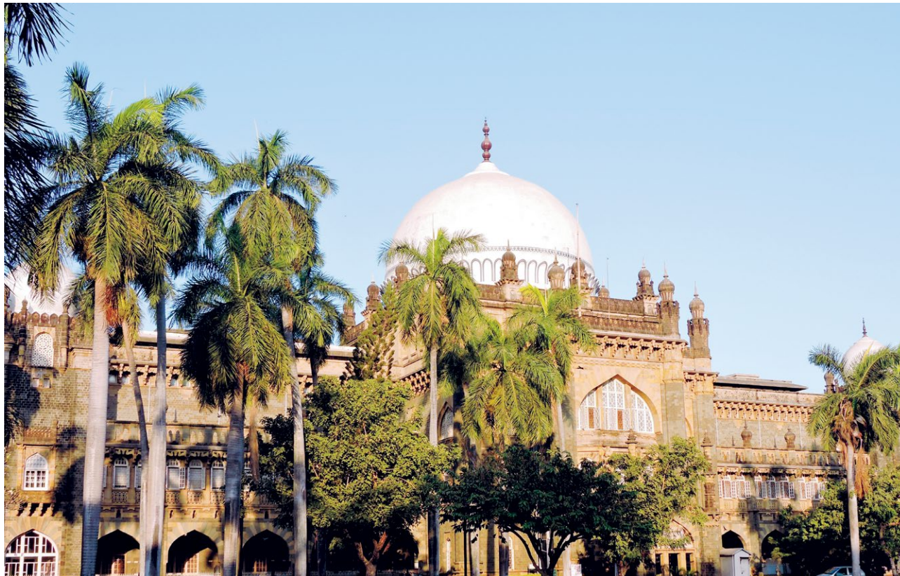
The Chhatrapati Shivaji Maharaj Vastu Sangrahalaya museum