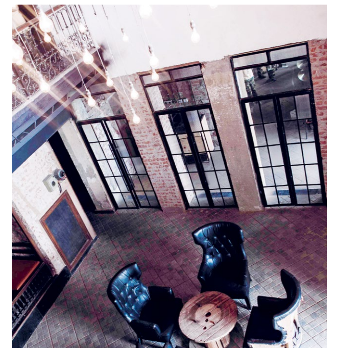
Hauz Khas Social