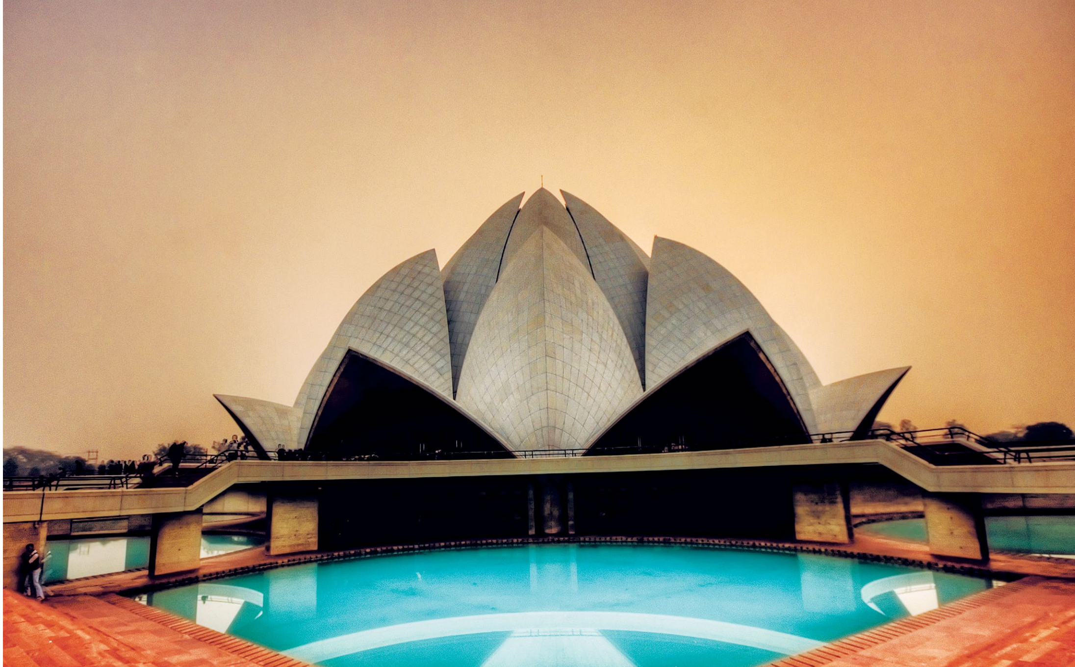
The Lotus Temple