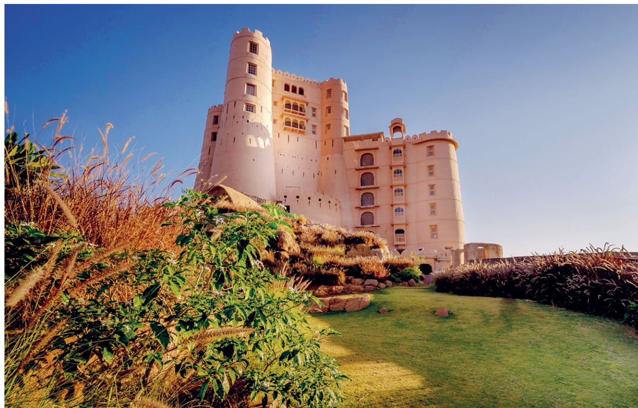
Alila Fort Bishangarh