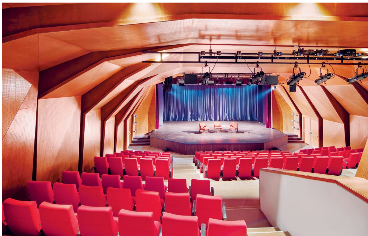
Arts and cultural hub, Bangalore International Centre

Founded in the 1960s, the Karnataka Chitrakala Parishath is a leading centre for visual arts in Bengaluru. Comprising a network of museums, galleries and archives, the complex features a valuable collection of pan-Indian folk, traditional, modern and contemporary art, alongside a college of fine arts, nurturing the next generation of Indian creatives.