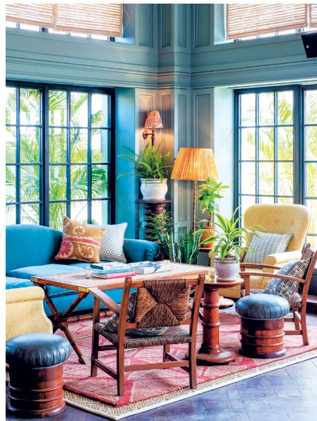
Join the club: Soho House Mumbai