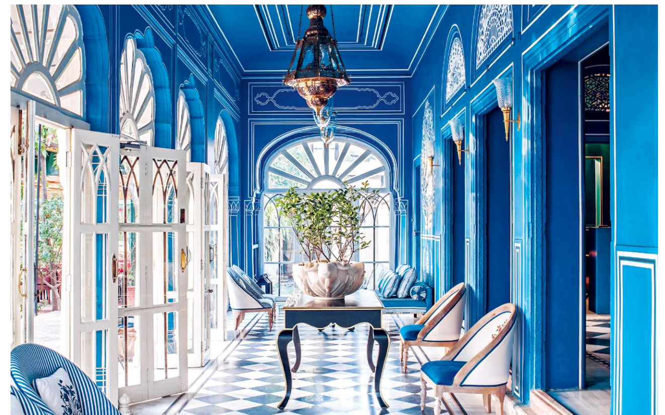
A taste of Italy: Bar Palladio in Jaipur, inspired by Venetian restaurants