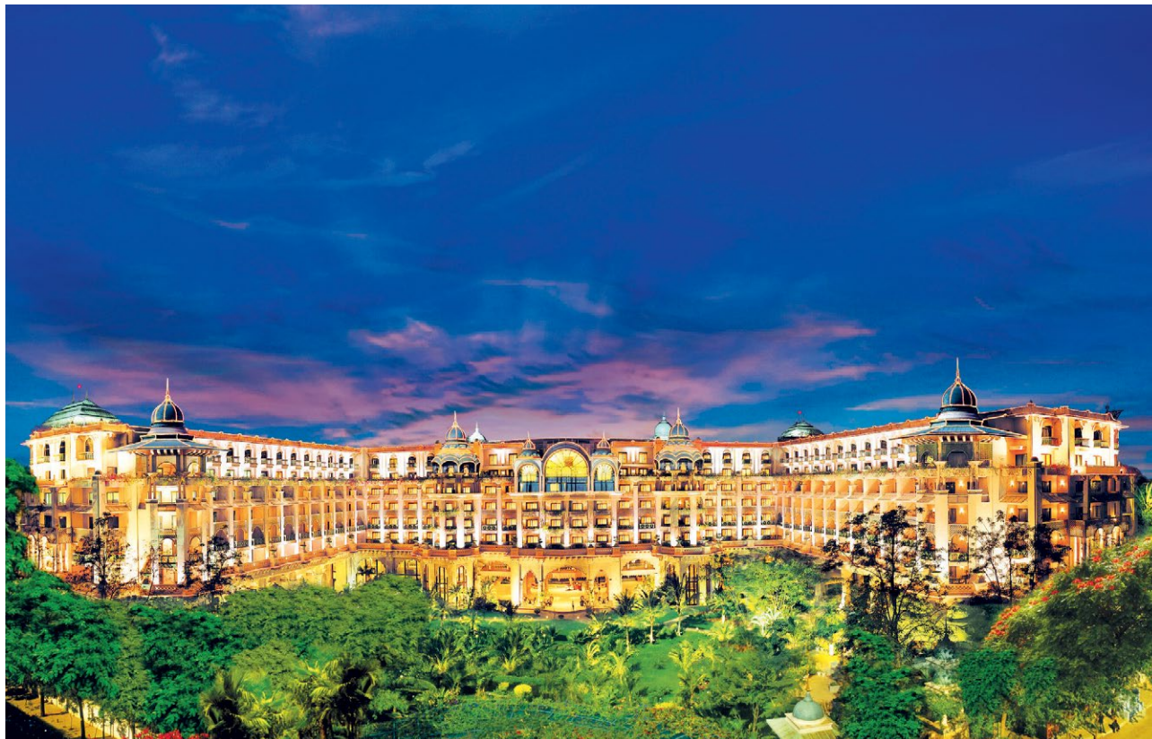
Art deco, Indian style: The Leela Palace Bengaluru