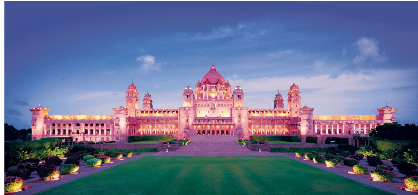
Umaid Bhawan Palace sits on Chittar Hill in Jodhpur