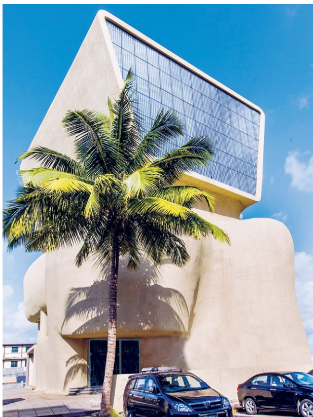
Bombay Arts Society headquarters by Sanjay Puri