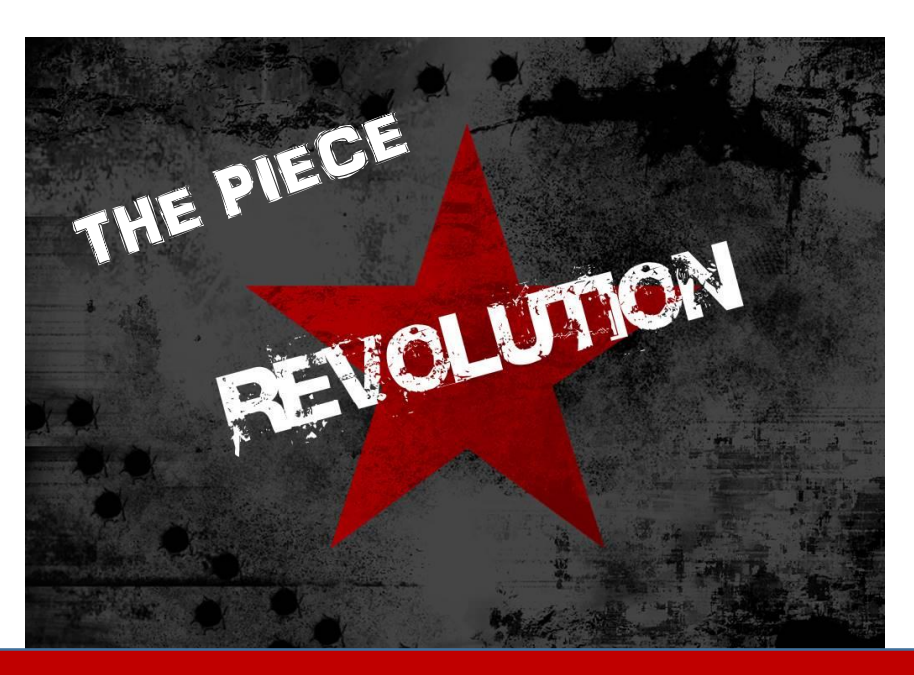
JOIN THE UPRISING TODAY.