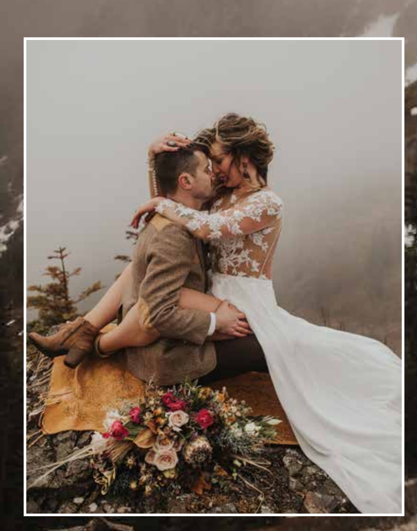
FLORALS: BRAMBLE FLORAL DESIGN; DRESS: A&BÉ BRIDAL SHOP - PORTLAND

their nights star-hunting in the desert. For those whose native language is wanderlust and the only rule is break all the rules. Don't get us wrong, we love urban nuptials, the glamour and grit of old industrial buildings and glassy facades, but there's some iconic about an al fresco wedding for the ages. Maybe it's because here in Central Oregon we have it all — the dusky red spires of Smith Rock, alpine lakes and snow-capped peaks, the sagebrush and sand of the desert — but we can't imagine any more beautiful witness to an exchange of vows than Mother Nature herself. It's a union between two people, and between them and the land.