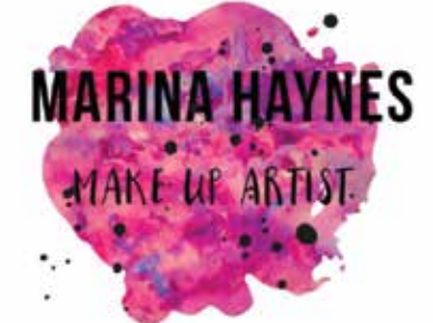
Serving the Pacific Northwest and always open to travel!