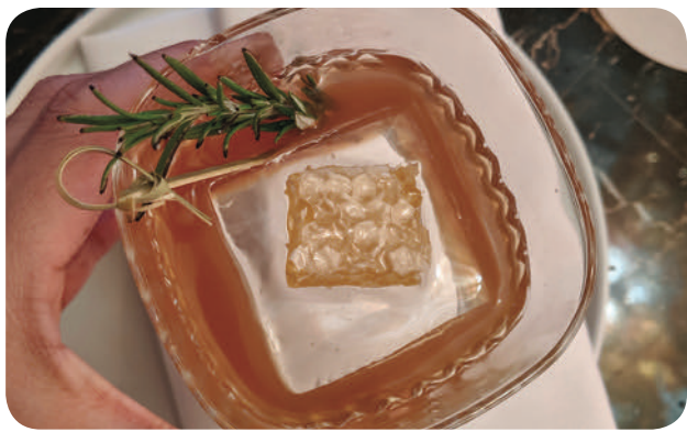
SIMPLYGLUTENFREEMAG.com JULY - AUGUST 2020 49

Sadly, there weren't enough hours in the day (or room in our stomachs) to try out some of Houston's other notably gluten-free-friendly spots, but don't be shy. Vibrant 's 100 percent gluten-free, refined sugar-free, and dairy-free menu full of goodies like turmeric bone broth, chickpea socca flatbreads, and cakes looked great; and I was eyeing the lemon poppyseed pancakes, veggie lettuce wraps, and brick chicken specialty over at Bellagreen .