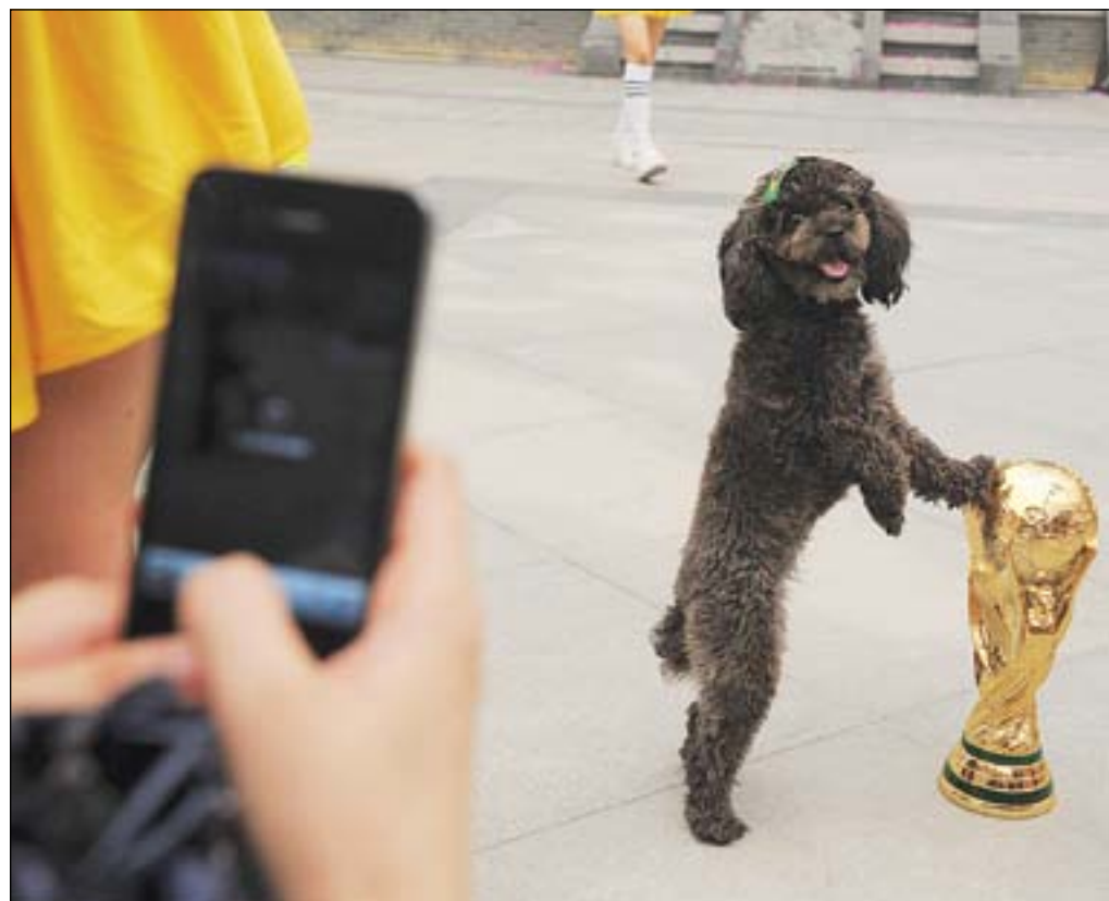
A dog with a Brazilian flag sticker on its head, touches a replica of the World Cup trophy as a visitor takes pictures during an event to celebrate the 2014 World Cup in Brazil, in Wuhan, Hubei province, on Thursday.