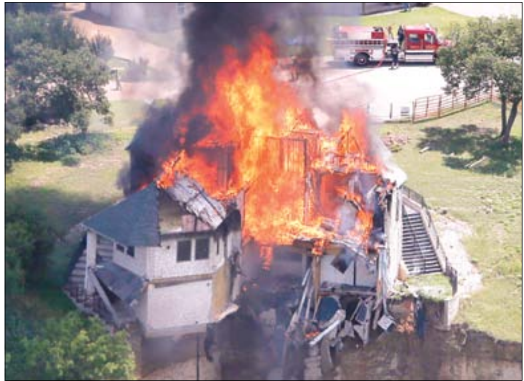
Smoke rises from a house deliberately set on fire, days after part of the ground it was resting on collapsed into Lake Whitney, Texas. Building crews set fire on Friday to the luxury lake house left dangling about 75 feet on a decaying cliff that has been giving way underneath the structure.

The burn, which was authorized by the homeowner, will be carefully monitored and comes after a demolition of the house was seen