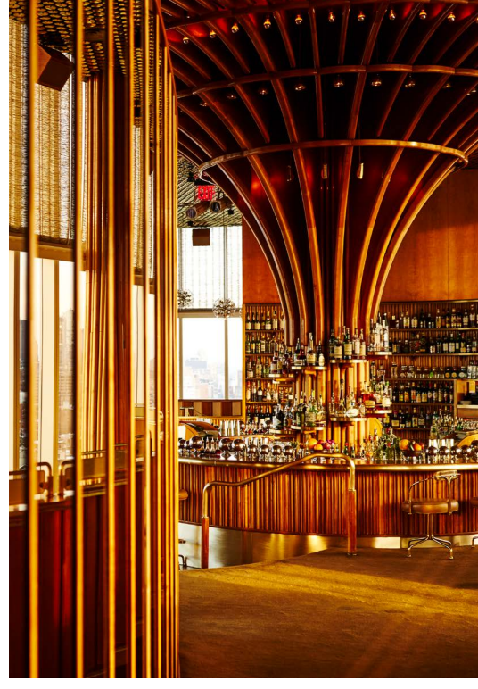
Above: Ceiling and bar, The Standard, High Line, NYC. Photos by Adrian Gaut Below: Moxy Times Square bar and mini golf, Photos by Warren Jagger