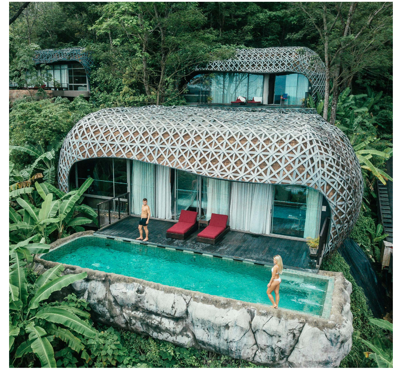
Keemala Hotel, Phuket.

An awareness of features that work as well on camera as they do in real life has become a driving force in hotel design. For beach properties and resorts, an infinity pool is now de rigeur. For urban