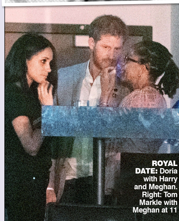
ROYAL DATE: Doria with Harry and Meghan. Right: Tom Markle with Meghan at 11