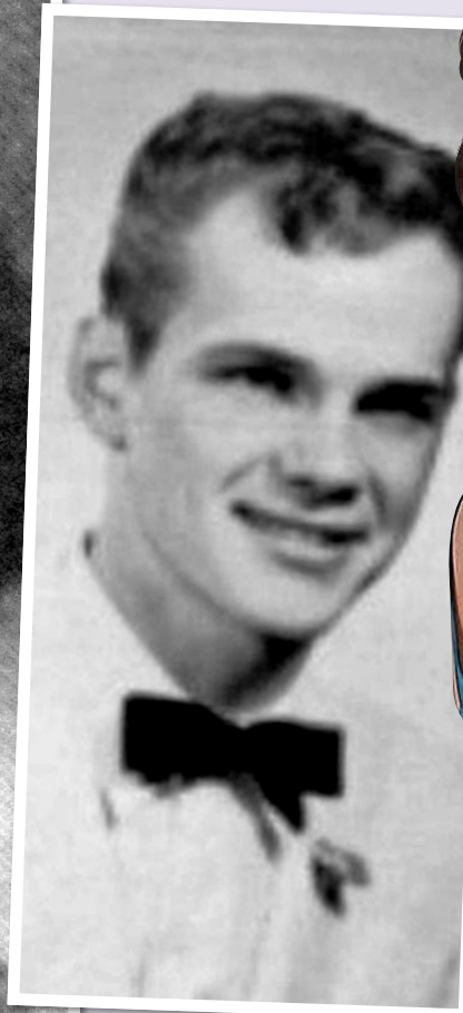
SCHOOL DAYS: Doria Ragland in her yearbook photo, aged 16. Above: Aged 18, Tom Markle, the man she would later marry and with whom she would have Meghan, right