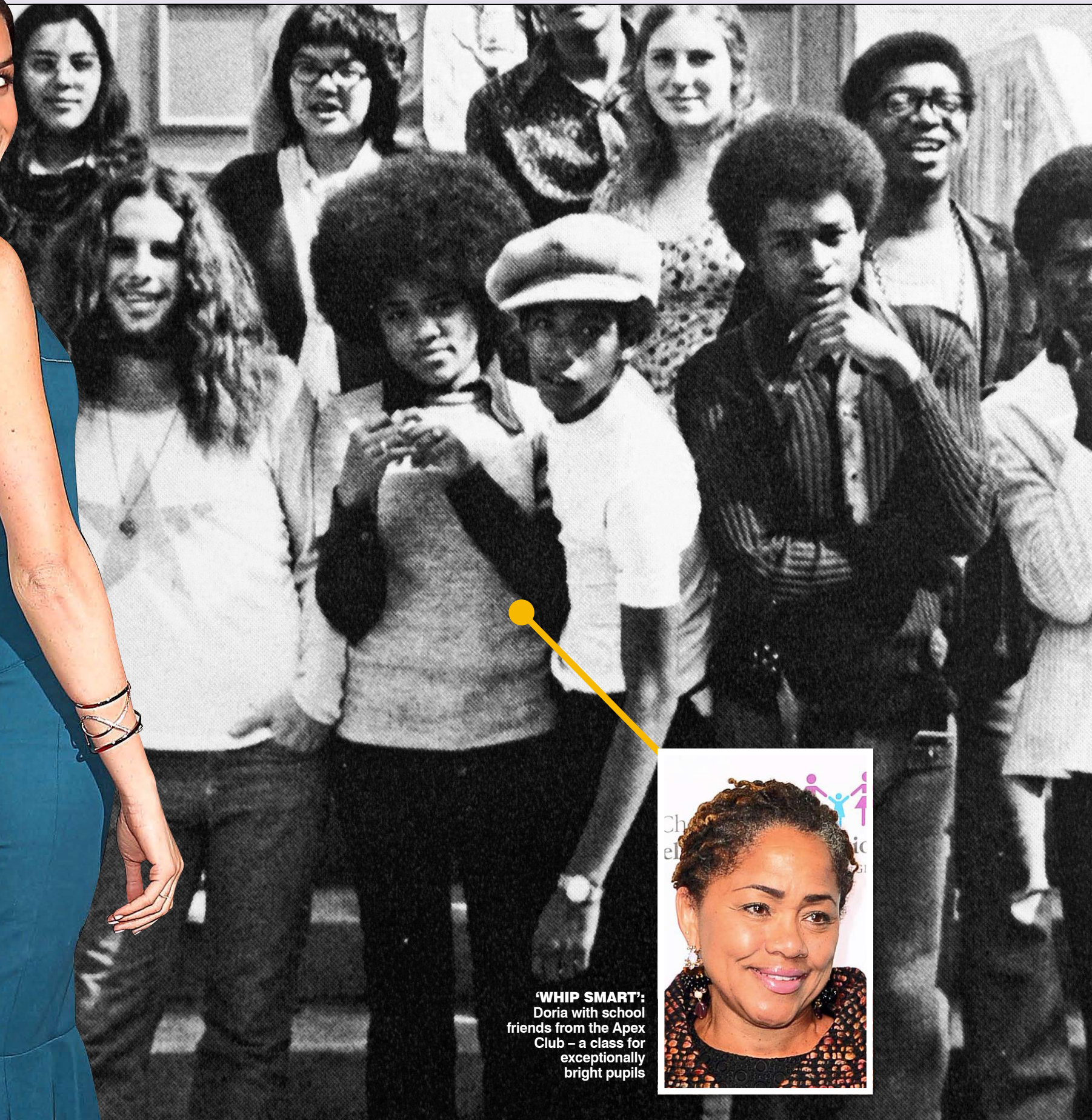
'WHIP SMART': Doria with school friends from the Apex Club – a class for exceptionally bright pupils