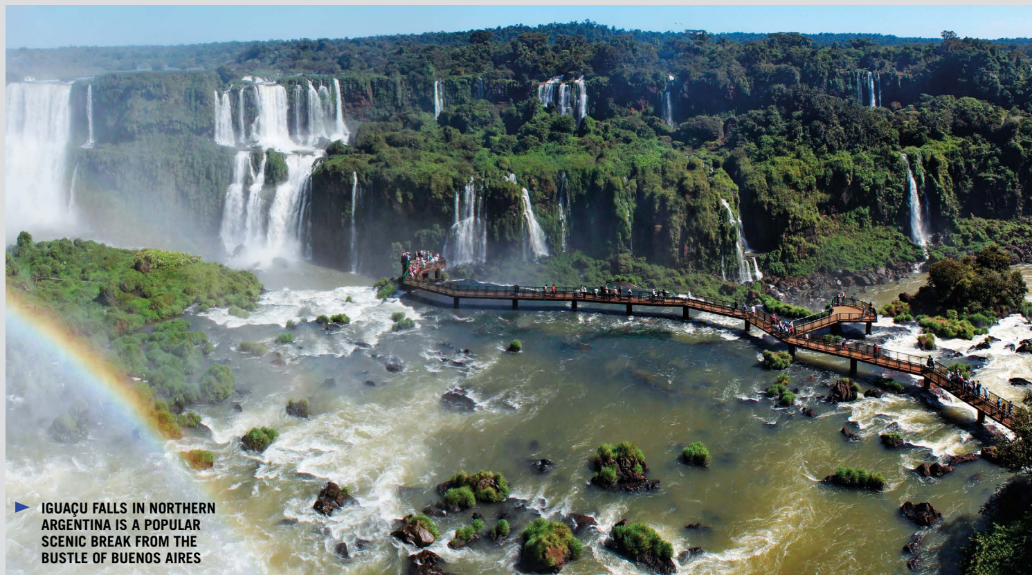
▶ IGUAÇU FALLS IN NORTHERN ARGENTINA IS A POPULAR SCENIC BREAK FROM THE BUSTLE OF BUENOS AIRES

Bordering Chile, Bolivia, Paraguay, Brazil and Uruguay, but with passion and melancholy imported from Europe and Africa, Argentina expresses its fiery soul in the tango. You can put your best foot forward and try this sensual dance in the atmospheric cafes, dance salons and milongas (tango events) of the capital Buenos Aires, also a fine place to visit a parrilla (steak house) and sample the beef that gives SA braais a run for their money. From the tropical gush of Iguazu Falls to the Andean peaks, Argentina's landscapes are breathtaking, typified by the image