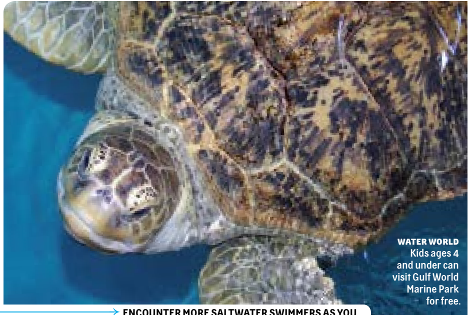
WATER WORLD Kids ages 4 and under can visit Gulf World Marine Park for free.

GETTING THERE Fly into Northwest Florida Beaches International Airport (ECP) or Pensacola International Airport (PNS). iflybeaches.com , flypensacola.com