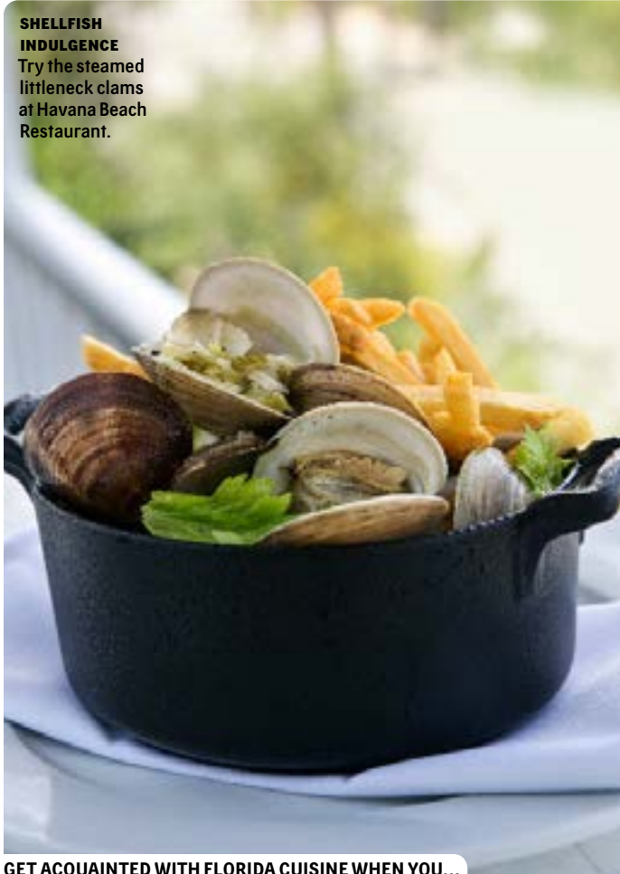
SHELLFISH INDULGENCE Try the steamed littleneck clams at Havana Beach Restaurant.