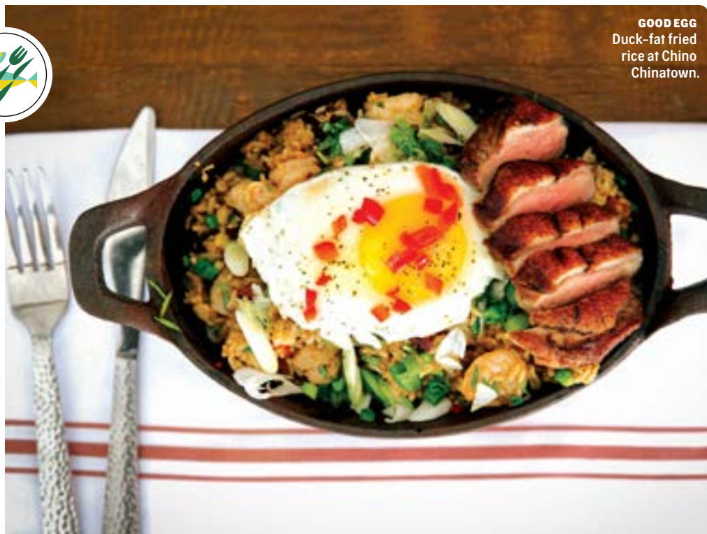
GOOD EGG Duck-fat fried rice at Chino Chinatown.

The Temptress Lakewood Brewing Company's imperial milk stout possesses a full body and rich chocolate flavor. lakewoodbrewing.com