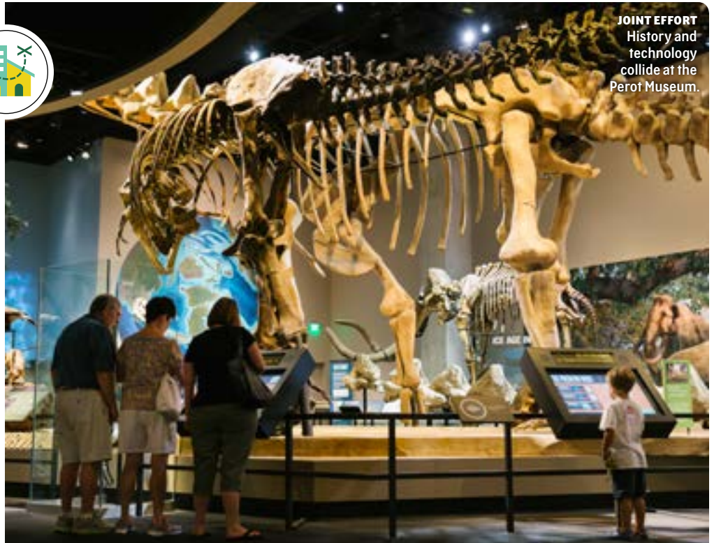
JOINT EFFORT History and technology collide at the Perot Museum.

This 50-story icon is topped with a web-like dome, home to an observation deck and a Wolfgang Puck restaurant. reuniontower.com Dallas Arts District See more buildings designed by Pritzker Prize winners in one contiguous location than anywhere else in the world. thedallasartsdistrict.org