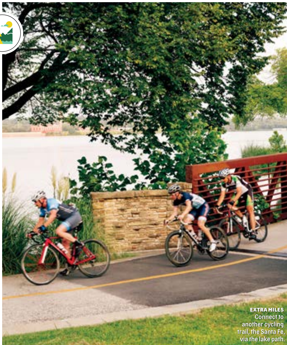
EXTRA MILES Connect to another cycling trail, the Santa Fe, via the lake path.