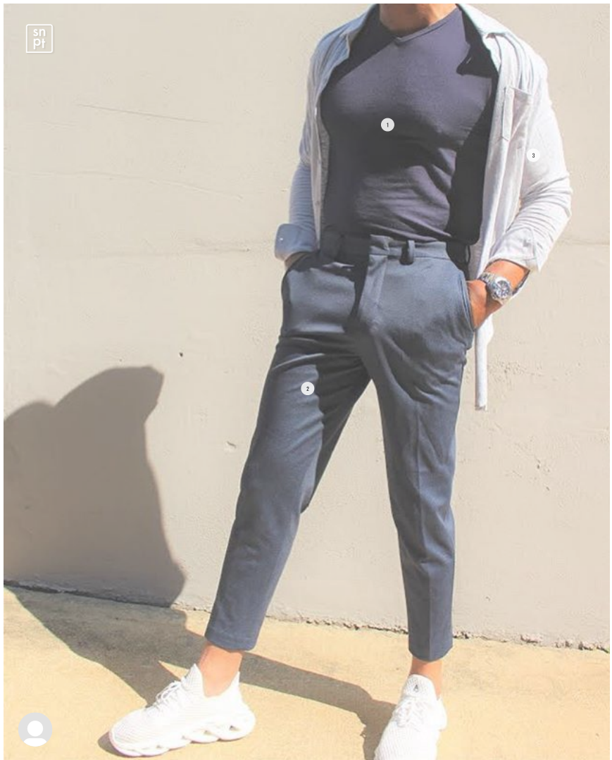
1 - calvin S/S Modal VNeck Tee 2 - Selected Homme Jersey Crop Pant Navy Twill | The Art Of Style 3 - Kinetix Essential Knit Collared Tee | The Art Of Style