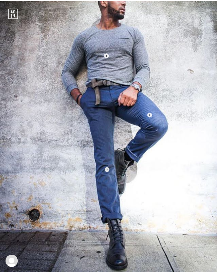
1 - Kineitx Essential Knit L/S Pocket Tee Heather | The Art Of Style 2 - Original Penguin Hernandez Chino Pinstripes | The Art Of Style 3 - Bed Stu D Ring