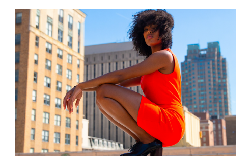
DRESS LIKE IT'S YOUR LAST DAY ON EARTH.