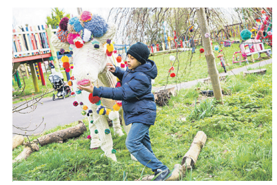
Wrapped in wool page 3