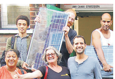
Solar start-up page 29