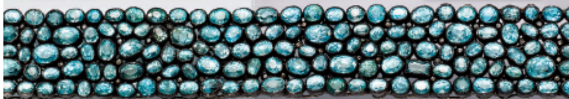
shades of blue

from a fresh focus on blues to the most modern of geometrics, it's all about what's new and what's news.