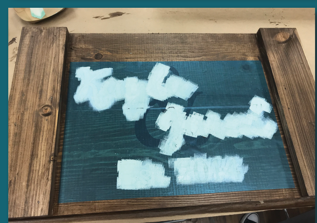
Currents | November/December 2017 | 53