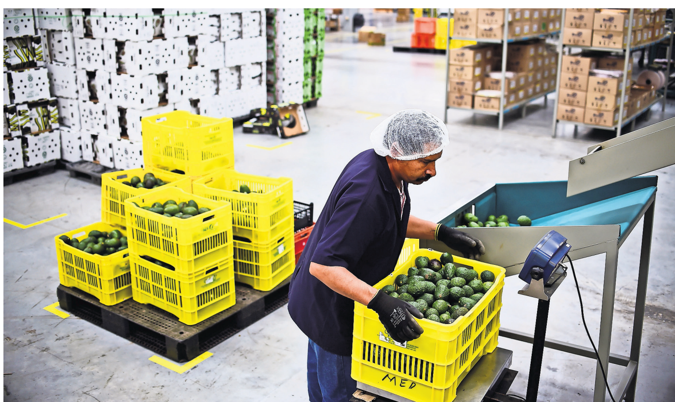
Mexico, a major avocado grower, is moving forward despite fear that the Trump administration will try to restrict trade.