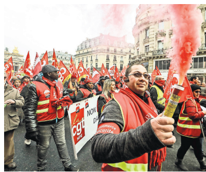
Some say changes to French labor code harm workers. Recent protests in Paris.

electric cars. France's unions are concerned that the outcome at PSA will be replicated by other companies. "This is a means for companies to get rid of employees with seniority, and therefore considered too highly paid, while at the same time recruiting precarious and disposable workers," said Philippe Martinez, of the General Confederation of Labor. The union spearheaded demonstrations last year to protest the labor law changes. Whatever the case, last month's announcements of job cuts will likely be followed by others, providing a test for Mr. Macron. He campaigned with pledges to make France more dynamic, but not at the cost of unraveling its social