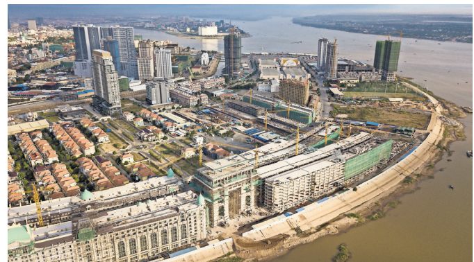
Phnom Penh is experiencing a building boom, and its main investors are coming from China.