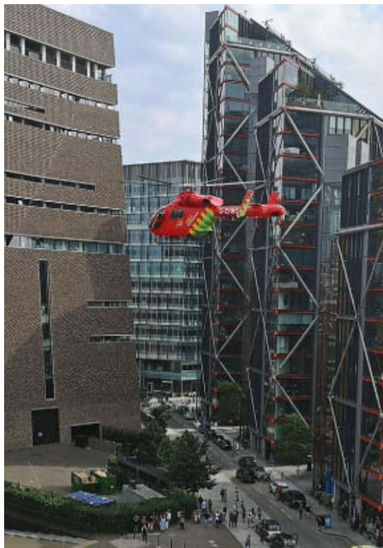
Emergency: The air ambulance flies in

She added: 'The six-year-old victim was found on a fifth-floor roof. He was treated at the scene