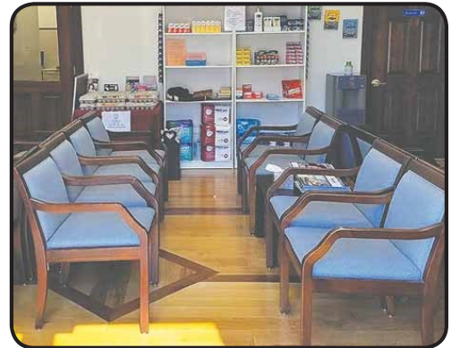
The Orange Free Clinic Moves to New Location....Page 2