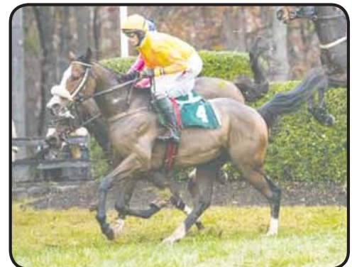
The Montpelier Hunt Races Saturday, November 5th...Page 9