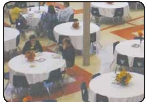
Local Organizations Assist in Spirit of Thanksgiving...Page 12