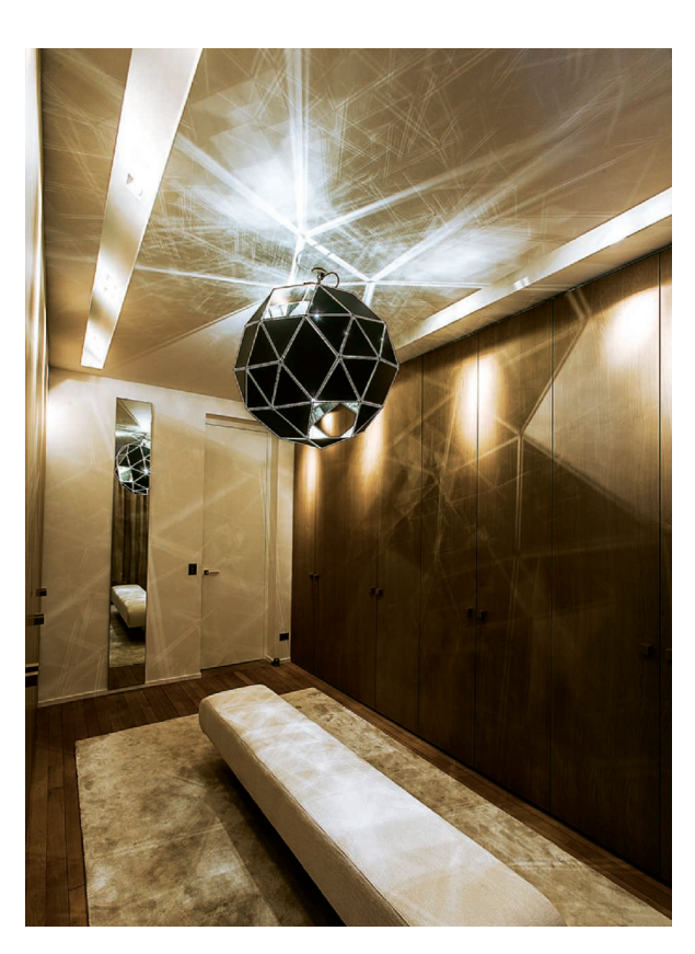
Above The statement light in the dressing room is by Olafur Eliasson. Below The lighting feature in the kitchen is by the French design duo Ronan and Erwan Bouroullec. One of just six signed pieces, it is made from resin and leather