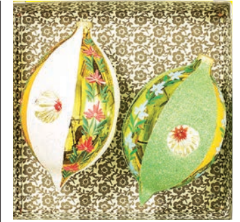
Above Christmas 'eggs', £18 each, Choosing Keeping (choosingkeeping.com). Below Swirl candles, from £6 each, The Edition 94 (theedition94.com)