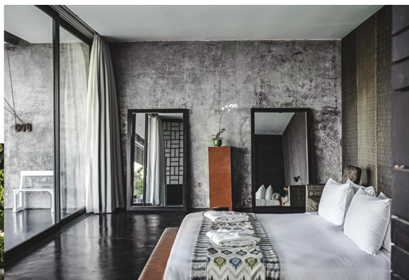
Villa Mana features three spacious master bedrooms (left) and three guest bedrooms