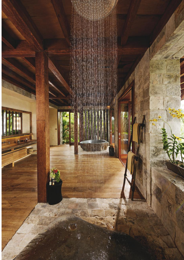
Eco-chic Hartland Estate (left); The Sacred River Spa at Four Seasons Resort Bali at Sayan can help balance your chakras (below)

The villa is a seven-minute drive from the centre of Ubud, Bali's holistic and cultural hub, where there are many ways to feel Zen. Start by immersing yourself in the landscape; Ubud's hypnotic mix of palms, forest and rice fields is its trump card. Then enjoy locally grown produce among the rice paddies at raw-food eatery Sari Organik (off Jalan Subak Sok Wayah), followed by a relaxing chakra treatment amid the lotus ponds of the nearby Sacred River Spa at the Four Seasons Resort Bali at Sayan (hotel. qantas.com.au/sayan ).