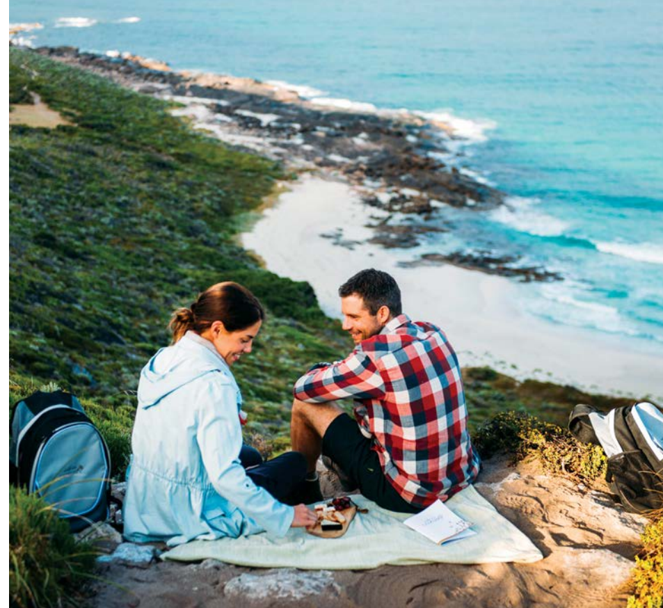
CLOCKWISE FROM TOP LEFT: Walk Into Luxury explores the coast of Western Australia; Taverna's haloumi, in Kingscliff, is legendary; inside Naracoorte Caves.